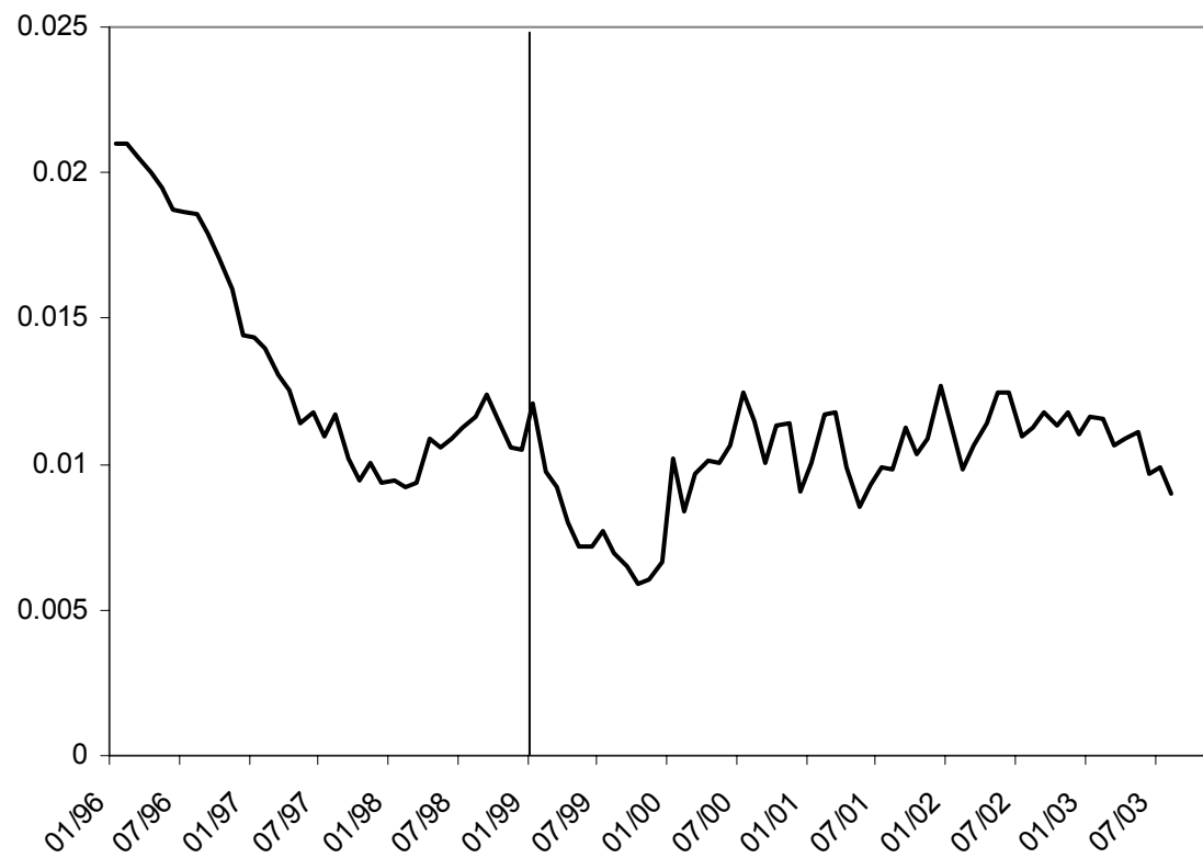
Figure 2: Standard deviation of unweighted inflation rates in the 12 Euro zone countries