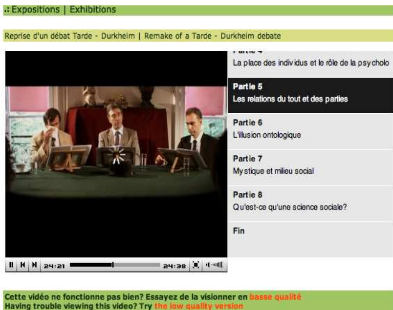
Figure 5. The Tarde/Durkheim 1904 debate replayed in Paris. http://www.bruno-latour.fr/expositions/debat_tarde_durkheim.html

My claim, or rather ANT’s claim and that of the revisited tradition dating from the great French sociologist, Gabriel Tarde, at the turn of the 19th century, is that the very idea of individual and of society is simply an artifact of the rudimentary way data are accumulated (Figures 5 and 6). The sheer multiplication of digital data has rendered collective existence (I don’t use the adjective social anymore) traceable in an entirely different way than before. Why? Because of the very techniques that you, Ladies and Gentlemen, have brought to the world.