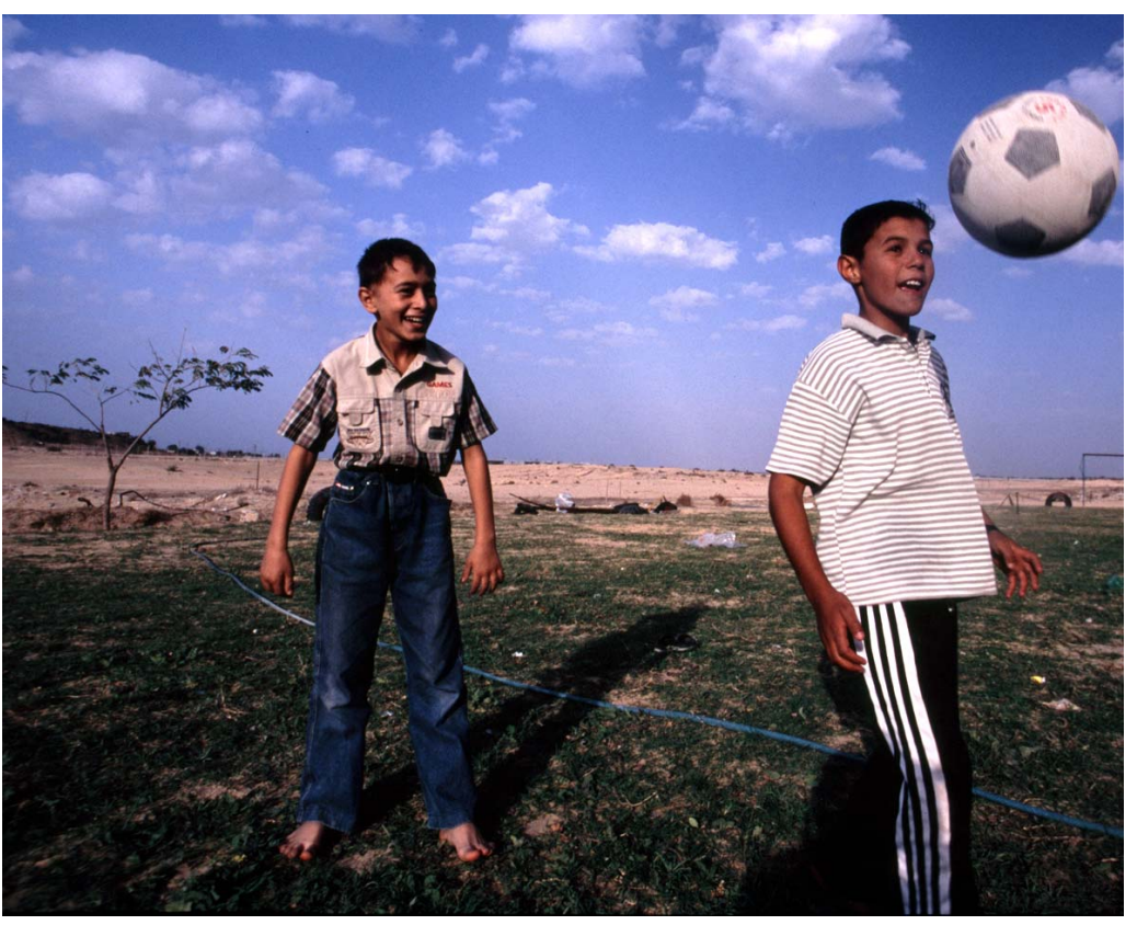
IMAGES FROM PALESTINE Two boys play soccer on a field in Rafah under the eye and barrel of Israeli sniper towers. Several children have been killed by sniper fire on this field. A few minutes after this shot was taken, Israeli snipers opened fire at the ground, sending everyone scurrying for cover.

After the 1993 signature of the Oslo Declaration of Principles between Israel and the