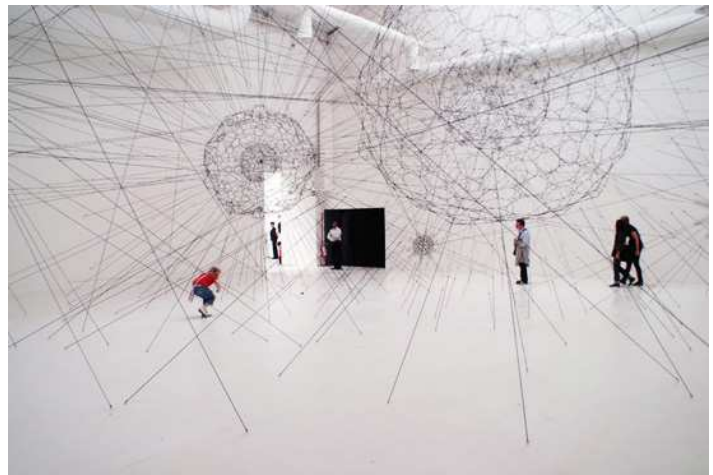
Tomas Saraceno, Galaxies Forming along Filaments, Like Droplets along the Strands of a Spider's Web , 2009.

Another remarkable feature of Saraceno's work is that such a visual experience is not situated in any fixed ontological domain, nor at any given scale: you can take it, as I do, as a model for social theory, but you could just as well see it as a biological interpretation of the threads that hold the walls and components of a cell, or, more literally, as the weaving of some monstrously big spider, or the utopian projection of galactic cities in 3D virtual space. This is very important if you consider that all sorts of disciplines are now trying to cross the old boundary that has, until now, distinguished the common destiny of increasing numbers of humans and non-humans. No visual representation of humans as such, separated from the rest of their support systems, makes any sense today. This was the primary motive for Sloterdijk's notion of spheres, as well as for the development of actor-network theory; in both cases the idea was to simultaneously modify the scale and the range of phenomena to be represented so as to renew what was so badly packaged in the old nature/society divide. If we have to be connected with climate, bacteria, atoms, and DNA, it would be great to learn about