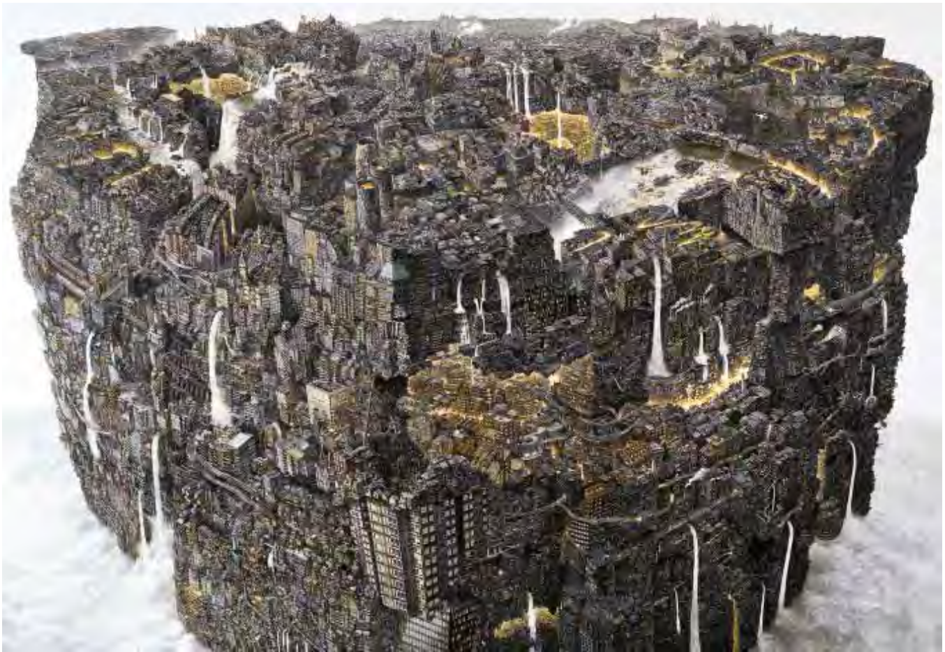
FIG. 12. Ikeda Manabu. Ark . Japan. Heisei period, 2005. Pen and acrylic ink on paper, mounted on board. 89.5 x 130.5 cm.

the romantically challenged. Could it be that the true purpose, Jesus suggests, is that Roppongi Hills is a giant, modern-day fertility tower for a decadent society blighted by terminal population decline and coitus interruptus?