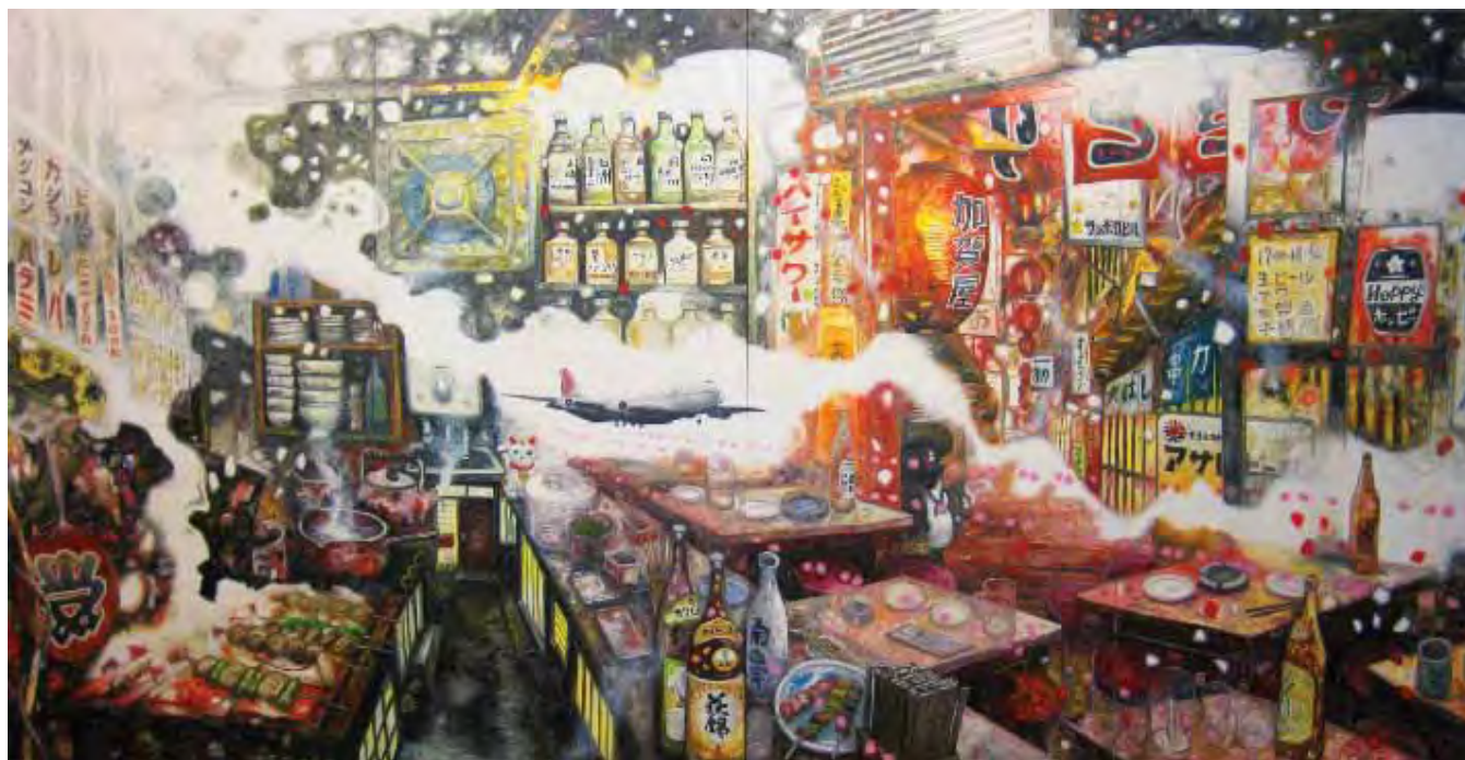
FIG. 9. Oscar Oiwa. Kita-Senjū . Japan. Heisei period, 2010. Oil on canvas. 227 x 444 cm.

Representing the rougher reality of the metropolis was also the modus operandi of the art unit Shōwa 40 nen kai (The Group 1965): the six-way personality clash of the mercurial talents (all born in 1965) of conceptual artist Aida Makoto; social and relational artist Ozawa Tsuyoshi; pop trash photographer Matsukage Hiroyuki; soulful painter Oscar Oiwa; naïve manga artist Kinoshita Parco; and electronics master Arima Sumihisa (figs. 7, 8). Stubbornly refusing to translate very much for confused foreigners, their on-and-off performances, provocative installations and 2008 Tokyo guide book mapped out their drinking habits, underworld tastes and bitter nostalgia for the disappearing corners of the city. 13 Above all, their art evoked the long Shōwa period (1926–1989) into which they were all born, in its clearly glorious fortieth year: 1965. As with all of Murakami's generation,