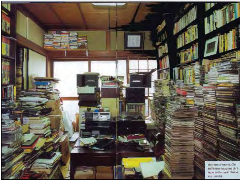
FIG. 10. A music critic's residence and workplace in a suburb of Tokyo, from Tsuzuki Kyōichi, Tokyo: A Certain Style . (San Francisco: Chronicle Books, 1999).