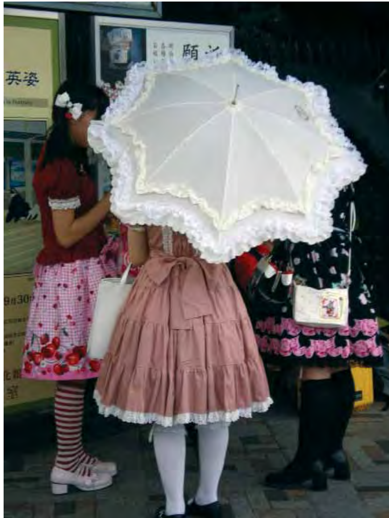
FIG. 3. Gothic Lolitas in Harajuku, Tokyo. 2008.