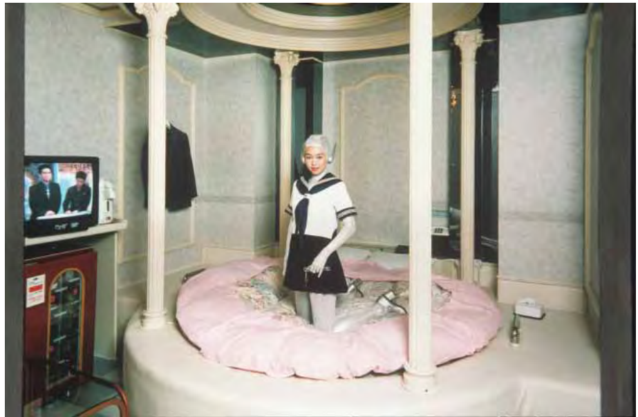
FIG. 5. Mariko Mori. Love Hotel . Japan. Heisei period, 1994. Fuji super gloss (duraflex) print, wood, aluminium, pewter frame. 121.9 x 152.4 x 5.1 cm. Edition of 4 +1 AP. Mariko Mori portrays herself in different roles in her cosplay ( kosupure or “costume play”) photographic series. Cosplay is the famous Japanese subculture in which Japanese otaku (“nerds,” or “obsessive fans”) play out the fantasy roles of fictional idols.

northeast became the next target of the governor and Tokyo developers, under the guise of a bid for the Olympics. A gargantuan steel TV tower—the Tokyo Sky Tree, even higher than the Mori Tower—was planted in the middle of a working-class neighborhood in Sumida Ward. And so it was: Twin Towers rising up to bury the past.