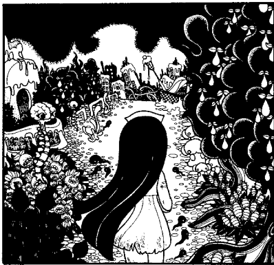
FIG. 2. Mizuno Junko. Illustration from Pure Trance (see fig. 1) © Mizuno Junko. Courtesy of the author

Nurse Kaori escapes to the outside “surface world” beyond the protective dome of the crazy underground city.