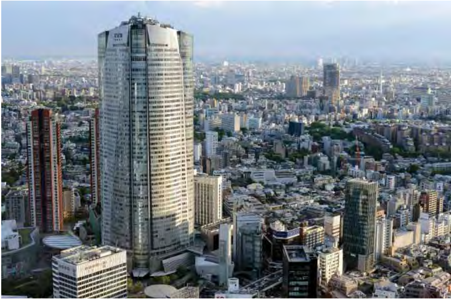
FIG. 4. Roppongi Hills and Mori Tower from Tokyo Midtown. 2013.

said to be the vastest in the world, can be seen from the roof of the highest tower—in the middle of a fatally dangerous major earthquake zone (fig. 4).