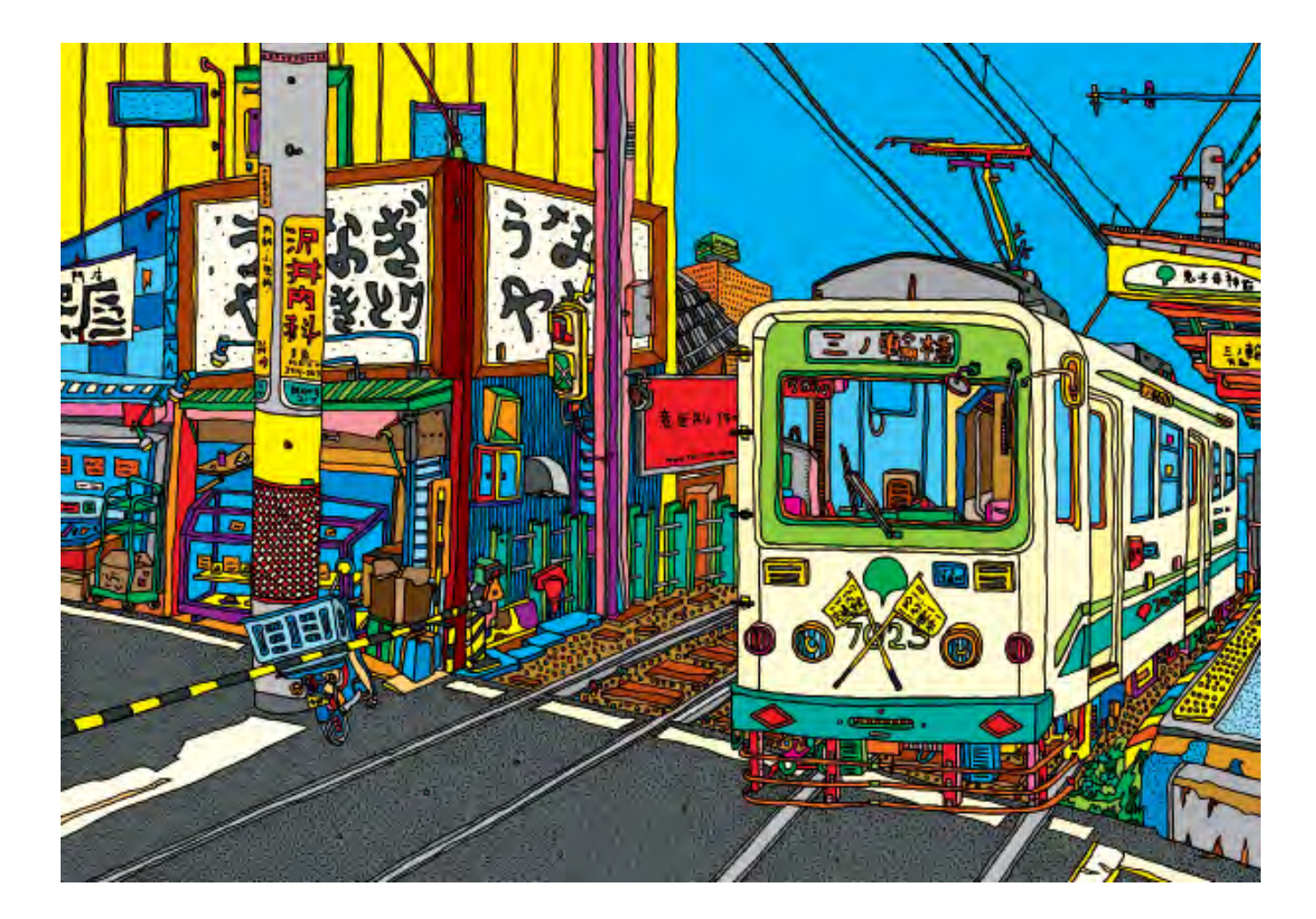
FIG. 13. Itadani Ryu. To-Den. Japan. Heisei period, 2005. Inkjet print on paper. 29.51 x 42.2 cm. © Itadani Ryu. Courtesy of the artist

As well-trained Japanese artists, the younger generation's graphic skills and sense of the urban are still evident. For example, the crossover graphic designer/artist Itadani Ryu (b. 1974) uses computer technology to render his vision of Tokyo, drenched in an attractive pop sheen of bright colors.<sup>18</sup> Notably, his sprawling visualization of Omotesando Hills, another Mori development, is less a cartoon and more a heightened reality. Itadani is just as fascinated by everyday, mundane objects. With acrylic on small white blocks, he paints his icons of Japanese consumption in the series Things That I Like, Hope You Like It Too (2007): beer, soy sauce, instant noodles, mayo, cheese and onion crisps and Tabasco sauce. Then there is his To-Den (2005), a warm celebration of this rickety prewar tram line, which connects some of the least glamorous northern quarters of Tokyo, making it a branded icon of the city (fig. 13). Could it be that the magic of this metropolis might be found just as readily in the rundown charms of the Machiya and Kita-Senjū districts, or of old Arakawa and Sumida Wards, far from the big-city vibe of Shibuya or Shinjuku? To-Den, indeed, is about as far as contemporary Japan gets from the shiny blur of the global brand image of the Shinkansen Bullet Train.