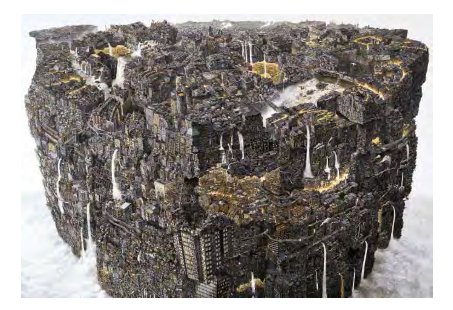
FIG. 12. Ikeda Manabu. Ark . Japan. Heisei period, 2005. Pen and acrylic ink on paper, mounted on board. 89.5 x 130.5 cm. Photo: Kioku Keizo © Ikeda Manabu. Courtesy Mizuma Art Gallery and Mori Art Museum

the romantically challenged. Could it be that the true purpose, Jesus suggests, is that Roppongi Hills is a giant, modern-day fertility tower for a decadent society blighted by terminal population decline and coitus interruptus?