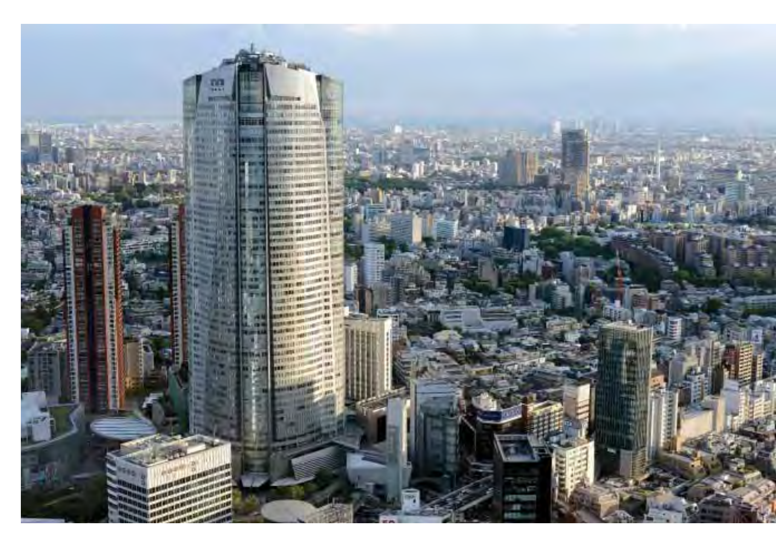
FIG. 4. Roppongi Hills and Mori Tower from Tokyo Midtown. 2013.

said to be the vastest in the world, can be seen from the roof of the highest tower—in the middle of a fatally dangerous major earthquake zone (fig. 4).