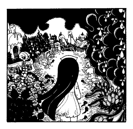
FIG. 2. Mizuno Junko. Illustration from Pure Trance (see fig. 1) © Mizuno Junko. Courtesy of the author

FIG. 3. Gothic Lolitas in Harajuku, Tokyo. 2008. Photo: Ann-Christina Lauring Knudsen