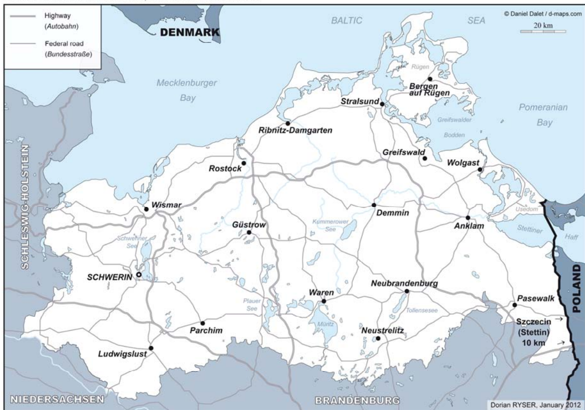
MECKLENBURG-VORPOMMERN, MAIN CITIES AND ROADS

MV, one of the five new German Bundesländer 2 (re)created in 1990 after the fall of the Berlin wall, lies in the very northeast of the Federal Republic. It ranks among the larger Länder (6th position, with an area of 23,188.98 km 2 ), but it is one of the least populated (14th position just before Bremen and the Saarland) with 1.642 million inhabitants at the end of 2010. Compared to the rest of Germany, it is very sparsely populated with 71 inhabitants per km 2 (the German average being more than three times higher at 230 inhabitants per km 2 and lower than the European average of 116 inh./km 2 ). MV is home to a great number of villages and small and medium-sized municipalities. The capital of the Land is Schwerin (95,041 inhabitants), and Rostock (201,442 inhabitants) is its largest city. MV is geographically the gateway to the Baltic North and East and to Scandinavia, with a 377 km coastline running along the Baltic Sea (excluding indentations) and a 78 km border with Poland in the east. The two cities of Hamburg and Berlin lie respectively about 60 km west and 60 km south, and Szczecin (Stettin) 10 km east of the borders.