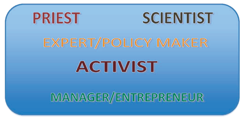
Figure 5.1. The Role of Scholars in a Changing University

This categorization, naturally, is simply an analytical typology underscoring the correspondence between the different missions of the university and the associated roles those missions would/should imply for scholars. Real scholars are generally much more complex than that and are not easily reduced to simple and uni-dimensional labels and categories.