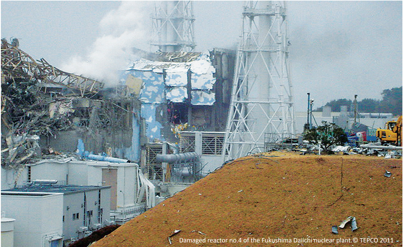
Damaged reactor no.4 of the Fukushima Daiichi nuclear plant.

The Migration, Environment and Climate Change: Policy Brief Series is produced as part of the Migration, Environment and Climate Change: Evidence for Policy (MECLEP) project funded by the European Union, implemented by IOM through a consortium with six research partners.