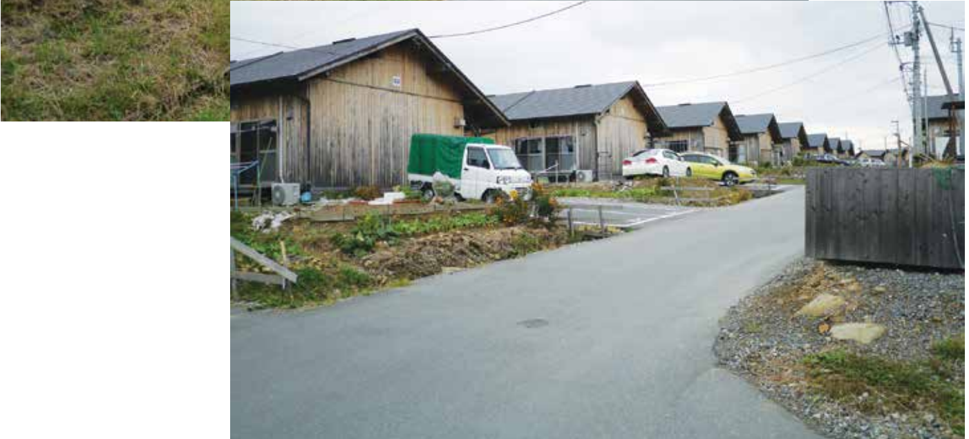
Temporary shelters for Naraha nuclear evacuees in Iwaki city (Fukushima).

their communities. The DEVAST field research found that they were often regarded as cowards or evaders who abandoned their communities and troublemakers who made Fukushima appear as an unsafe place to live among the general public, thus jeopardizing the collective effort to reconstruct Fukushima. Although this negative perception has somewhat improved over the last few years, the trauma from such a divide still remains within these communities.