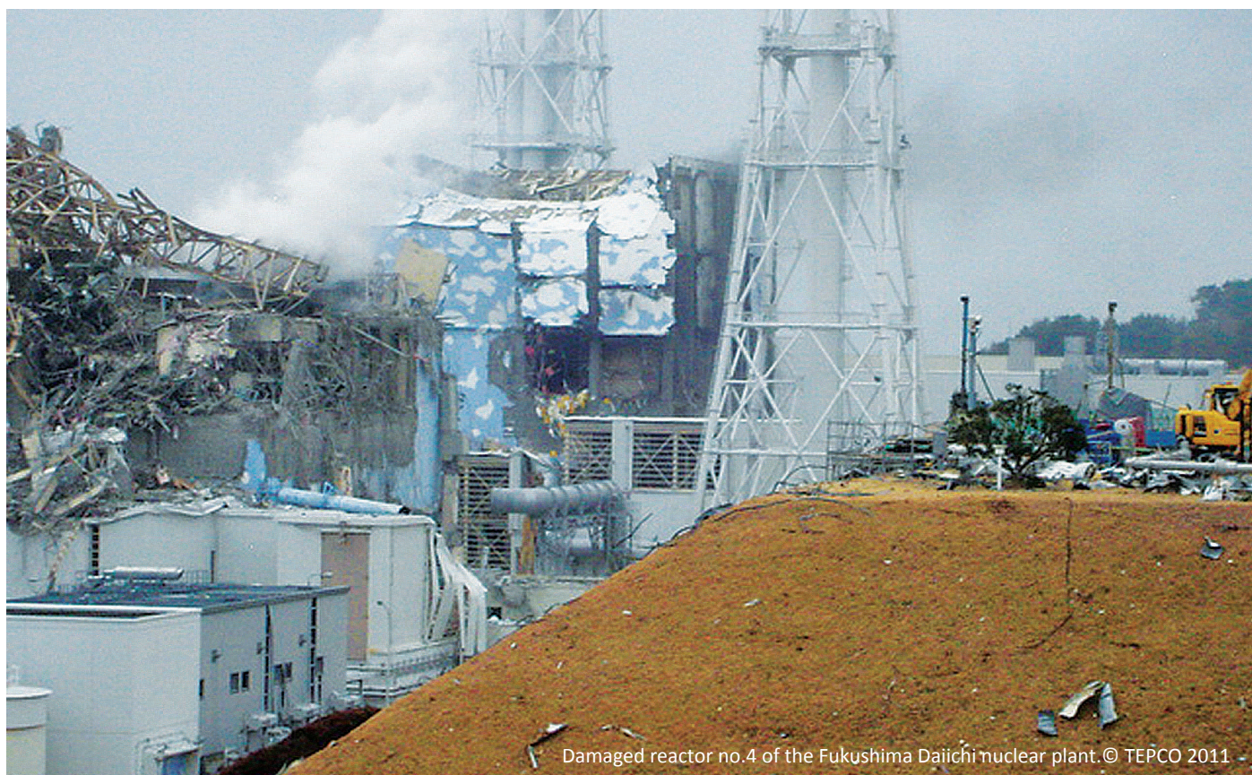
Damaged reactor no.4 of the Fukushima Daiichi nuclear plant.

The Migration, Environment and Climate Change: Policy Brief Series is produced as part of the Migration, Environment and Climate Change: Evidence for Policy (MECEP) project funded by the European Union, implemented by IOM through a consortium with six research partners.