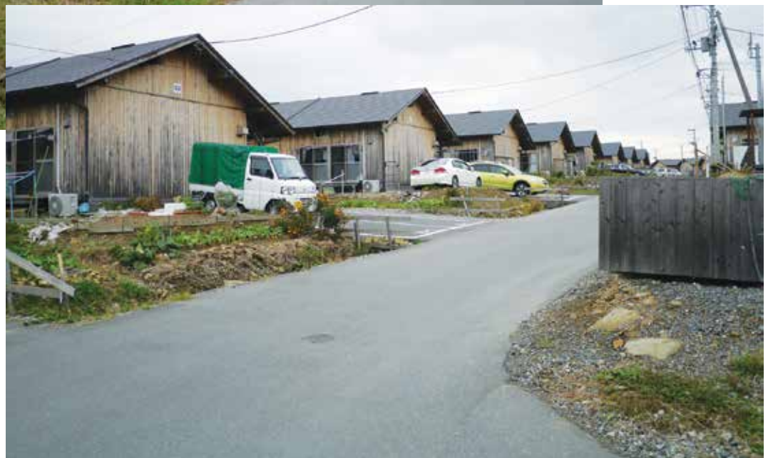
Temporary shelters for Naraha nuclear evacuees in Iwaki city (Fukushima).

their communities. The DEVAST field research found that they were often regarded as cowards or evaders who abandoned their communities and troublemakers who made Fukushima appear as an unsafe place to live among the general public, thus jeopardizing the collective effort to reconstruct Fukushima. Although this negative perception has somewhat improved over the last few years, the trauma from such a divide still remains within these communities.