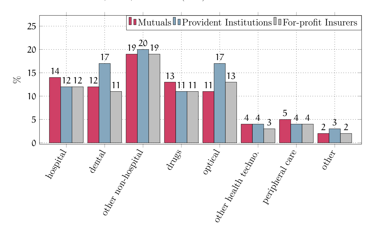
Figure 2: Share of Private Health Insurance Benefits

In November 2014, a decree relative to private health insurance contracts reinforced this trend. Its goal was to curb the rise of extra-fees charged by several healthcare professionals, such as medical doctors but, more importantly, dentists and opticians. To this end, it forced private health insurers not to reimburse the supplementary share of health benefits exceeding a certain amount of money: in this context, they cannot guarantee to insured persons, even for the most generous contracts, that their expenses will be fully covered in any case, especially if they have consulted a health professional who charges extra-fees. Private health insurers cannot thus reimburse more, and are constrained to pay less. If they want to maintain high levels of coverage, they are incited