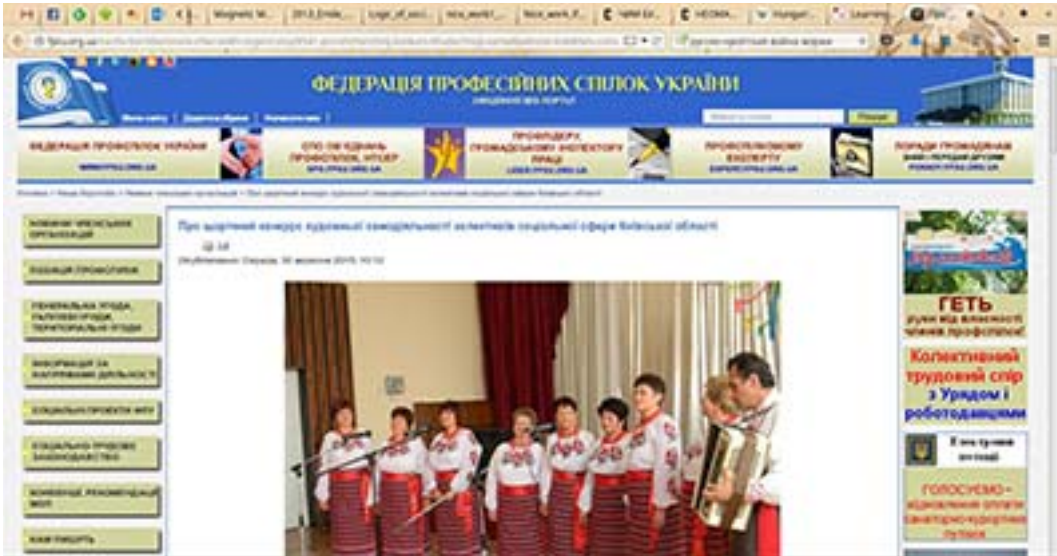
FIGURE 1: “Our Struggle”: screenshot from the FPU’s website

edges that the KVPU is not built like union federations in other countries, where leadership changes regularly. He says his retirement will mean the end of the whole organization.