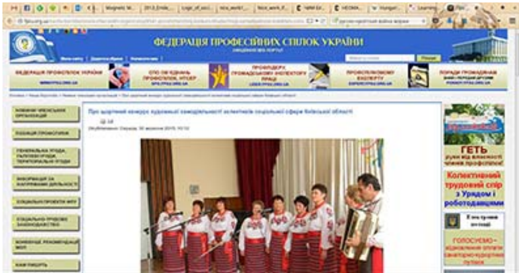
FIGURE 1: “Our Struggle”: screenshot from the FPU’s website

edges that the KVPU is not built like union federations in other countries, where leadership changes regularly. He says his retirement will mean the end of the whole organization.