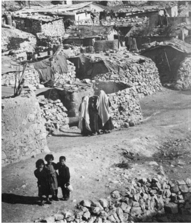
From Wadi Seer to Amman new camp (Jordan), 1959