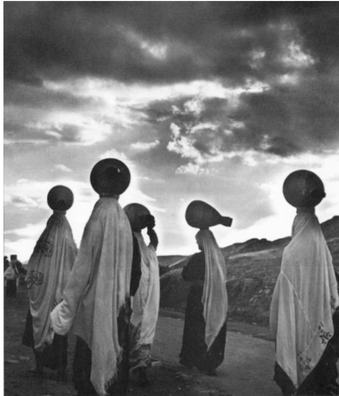
Aqabat Jabr refugee camp, Jericho (West Bank)