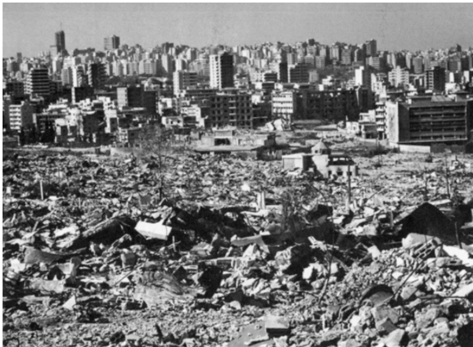
Dekwaneh Camp in Beirut (Lebanon), 1975-1976.

Tal al-Zaatar, a neighborhood in the eastern outskirts of Beirut included the Dekwaneh Palestinian refugee camp. During the Lebanese civil war, the camp was held under a 52-day siege (as two other camps) and razed to the ground. Survivors scattered in other camps. The rubble in the foreground is what remained of the camp.