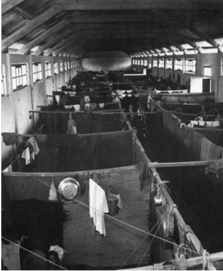
Mia Mia camp, near Sidon (Lebanon), 1952