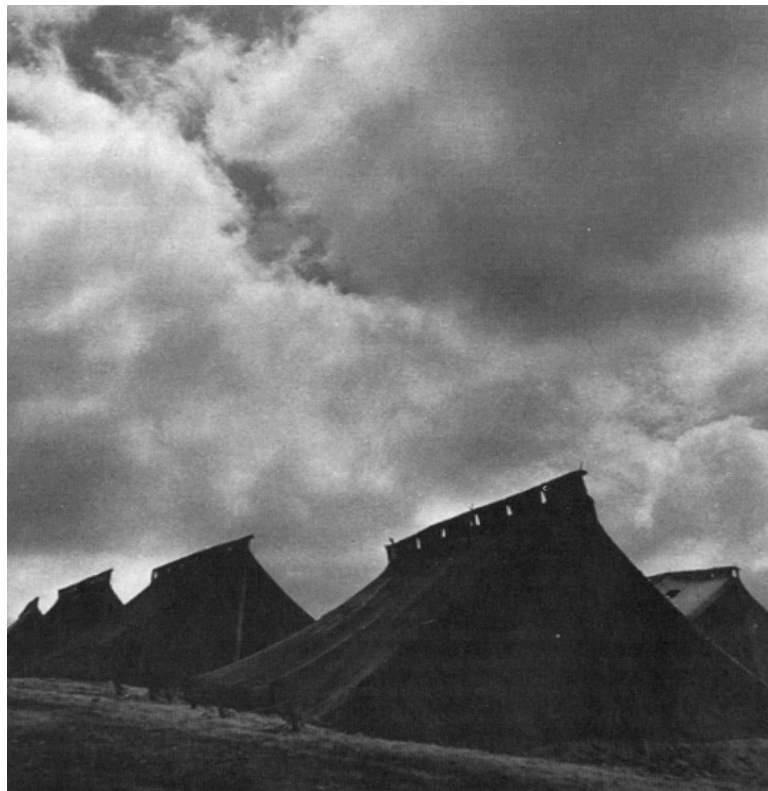
Jisr el Basha Refugee Camp in the outskirts of Beirut, Lebanon, 1952.

In spite of this, some of UNRWA's photographs defied these constraints in an artistic manner that suggested there was more than what is in the frame and a representation of time that Roland Barthes would have identified as "a pure representation of time". There is another " punctum (another 'stigmatè') beside the 'detail'. This new punctum , is not one of form but of intensity" 38 .