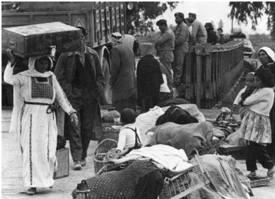
Jordan Valley, Exodus, 1967

awareness of an archive potentially being established. From 1967 onward, there is noticeable change: few photos are without date or appear to blur history, events are integral to the framing of a photograph and are the subject of numerous pictures. This is particularly clear in the many photographs of the 1967 exodus and the effects of the Lebanese civil war on Palestinian refugees and camps. Thanks to the captions - which are generally useful even if a few are inaccurate or too general - there are clues to determine when, roughly, a photograph was taken. Often times, the dating is done in terms of historical periods defined by key historical events: the years following the 1948 exodus; before, during or after 1967 (as the camps of Jericho were almost emptied after the second exodus); between 1967 and 1975 (beginning of the Lebanese war) and after, etc. The issue of date is also key as far as films are concerned: indeed, some only carry the indication 1948-1950, pre-1967 or post-1967 and sometimes 1960s, 1970s, mid-1970s, or even 1980s 40 .