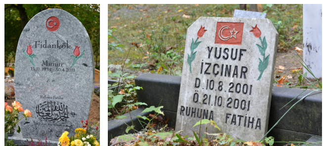
Figures 4 and 5: Graves featuring Turkish Flags and Islamic referents. Note that the grave on the right is for a two-month old baby.

Among the different nationalities represented within Berlin's Islamic burial sections, the Turkish flag appears far more frequently than others. While only 10 percent of the tombstones surveyed included flags, 90 percent of these were Turkish flags (see figures 4 and 5). One could read this as a sign of greater (real or aspirational) nationalist sentiment among Berlin's Turkish population or as a strategy used by Turkish Muslims to distinguish themselves from other national groups. Skeptics might argue that the existence of a Turkish flag in a German cemetery evinces a lack of integration or assimilation to the dominant culture. Yet, there is a certain ambivalence at play, given that the deceased is buried in Germany and hasn't been repatriated to Turkey for burial. While the flag might be Turkish, the body remains in Germany and serves as an anchor and reference point for future generations. Like the practice of marking a foreign birthplace, the flag simultaneously acknowledges a migratory history and the reality of the community's presence in a new land.