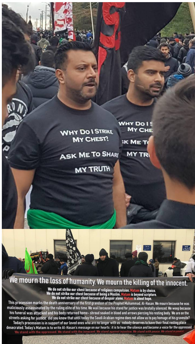
Image 2: A Toronto initiative to educate about ritual commemoration developed in reaction to public criticisms of matam .

or posted decontextualized videos online as a means of stirring up controversy. 19 Certain clerics have also made a name for themselves by criticizing the practice in their sermons. This has, in some cases, prompted responses from practitioners of matam eager to defend the practice. As a reaction to the proliferation of criticisms of matam in and around Toronto, for instance, matamis in the city created banners and t-shirts aimed at debunking misconceptions of matam as a barbaric or threatening practice (Image 2).