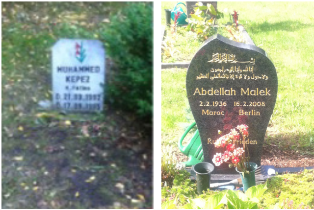
Figure 2 (“R. Fatiha”) and Figure 3 (“Maroc / Berlin”)

text on these grave markers is not in German. Of the tombs surveyed, 77 percent have monolingual inscriptions in Turkish, Arabic, or Bosnian. The remaining 23 percent incorporate text in two or more languages, including German. Although multilingual messages are present in some of the earliest graves surveyed here (from the 1990s), they are more numerous from the 2000s forward, reflecting a trend towards linguistic syncretism (see figure 3). Biographical information is conveyed through short inscriptions that contain a family's genealogy, kinship terminology, places of birth and origin, and occasionally information about the deceased's occupation, hobbies, or interests. Often these texts are paired with images and icons.