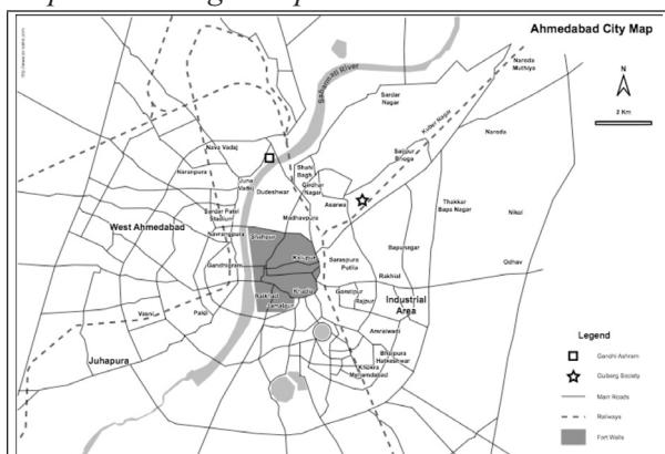
Map 1: Locating Juhapura