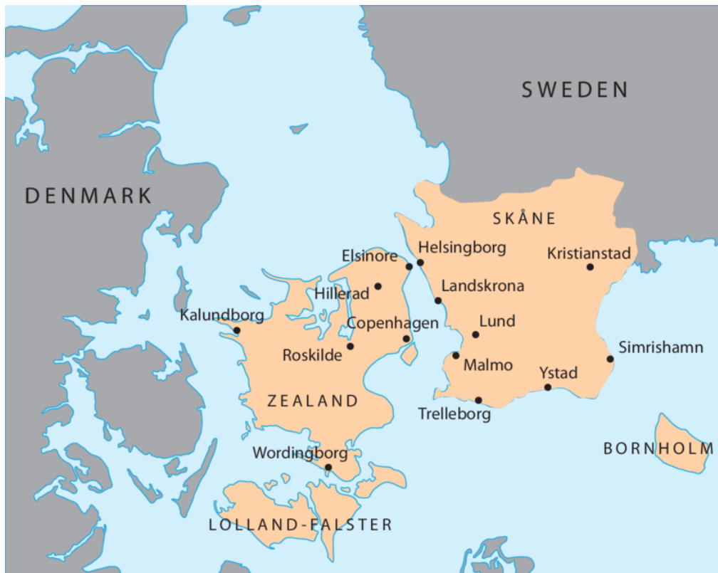
FIGURE 1: Öresund region

The Öresund “region” labels the land areas surrounding the Öresund strait, which constitutes the border between Sweden and Denmark. It covers an area of 20.859 km 2 and consists of roughly three parts: the metropolitan area of Copenhagen, its suburban area, and Scania (Skåne) on the Swedish side (see Figure 1). However, it is important to note that the term “Öresund region” does not describe an administrative region, as relevant political and administrative powers remain firmly embedded in national structures on either side of the national border. The Öresund region is thus not a functional region in the sense of an integrated labor market.