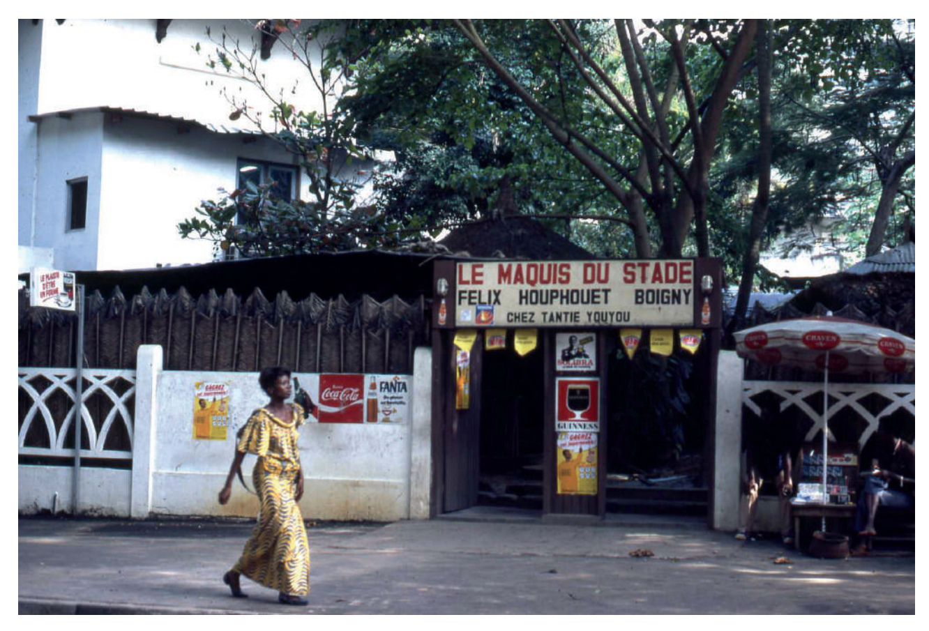
Abidjan, 2002

NORIA is a network of researchers and analysts which promotes the work of a new generation of specialists in international politics.