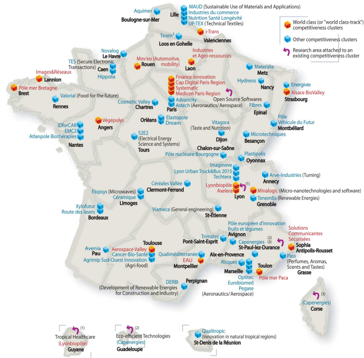
Figure 1: Map competitiveness clusters

For more information about Competitiveness clusters : www.competitivite.gouv.fr/en