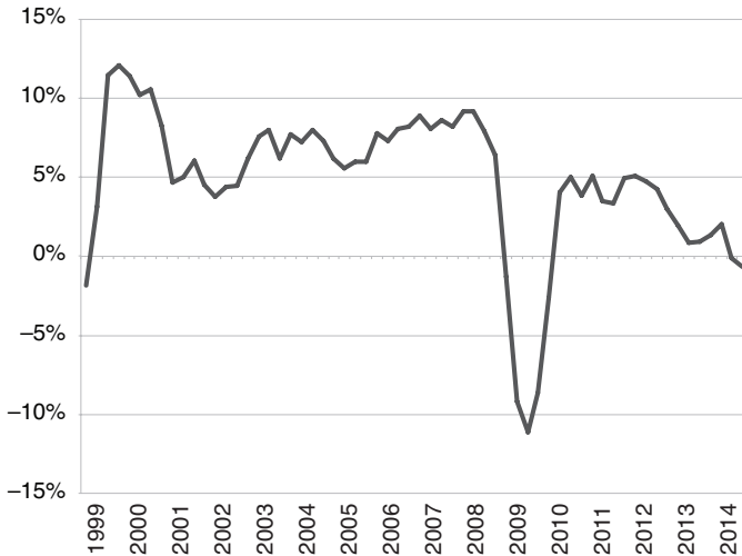
FIGURE 1 RUSSIAN GDP GROWTH, QUARTERLY DATA (YEAR-OVER-YEAR)

Sources: New Economic School and Renaissance Capital, RenCap-NES Macro Monitor: Russia (April 2014).