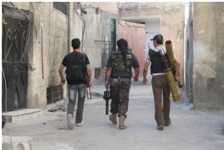
Free Syrian Army fighters carry their weapons to the frontline in Damascus.

Counterterrorist and counter-radicalisation policies not only have the potential to undermine the democratic principles, institutions, and processes they seek to preserve but also to produce unintended consequences.