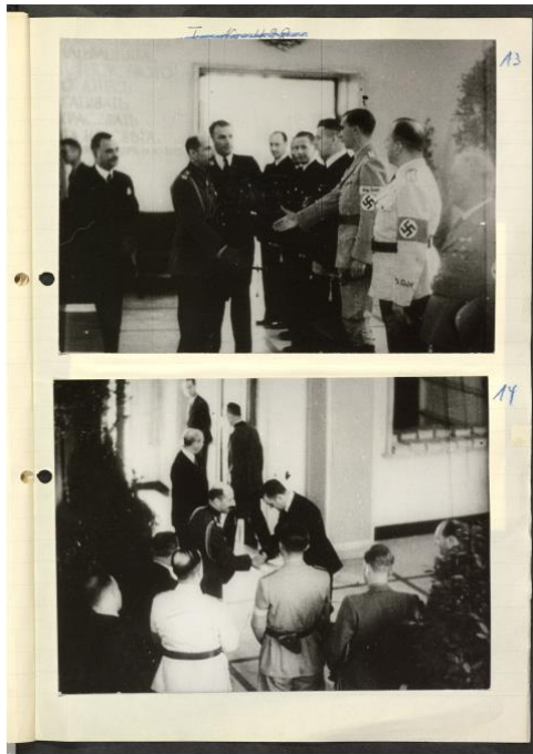
Figure 2. Seventh page of the photographic album featuring King Boris, Frankfurt-am-Main, 1967-1968.

At this point of the investigation, we begin to journey into the realm of hypotheses, an act obliging us to take several rapid jumps in time and space as we explore East-East cooperation. The first stop is in Sofia in 1983, at a meeting between representatives of the State Film Archive of the GDR and the Bulgarian National Film Archives. At this meeting, the archivists from East Berlin were shown film footage of deportation – a positive – accompanied by a German soundtrack. They took detailed notes of the images, which were grouped in three sequences, described by them as follows: