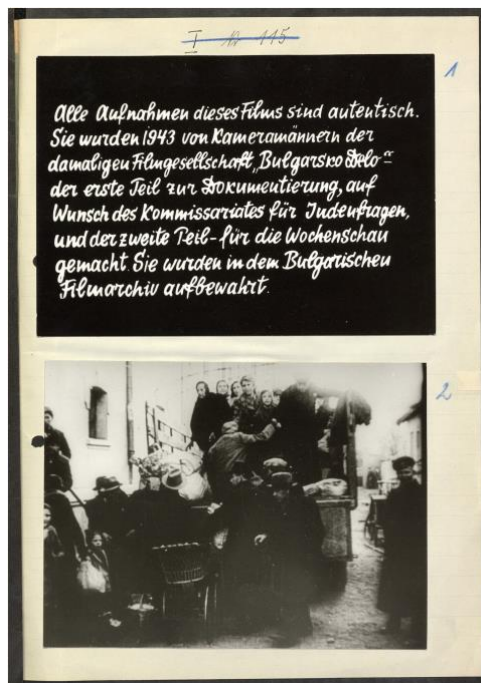
Figure 1. First page of the photographic album compiled by the accusation, drawing on the 1943 rushes of 1943, Frankfurt-am-Main, 1968.

The following three show King Boris standing next to Nazi and SS guests (one of these stills appears as Figure 2); in the last picture, Beckerle can be seen ratifying an agreement. The origin of these four shots remains to be identified. (The 15th frame comprises text attesting to the authenticity of the material.)