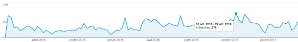
Trend in hits on the Hyphe showcase site (with demo) since its launch in 2015