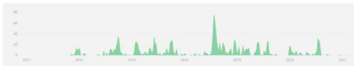
“Commits” on Hyphe, visible on its GitHub repository

Contributions to master, excluding merge commits