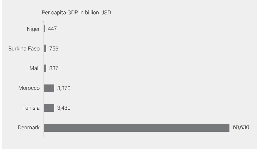
Sahel state's GDP per capita remains extremely low

State weakness in the Sahel is a key factor in explaining why and how trans-regional jihadist movements and migration have developed into challenges and threats to European security and stability. One way to illustrate this weakness on the part of the Sahel states is to examine the macro-indicators of the various national economies. As shown in the figure below, Sahel states' GDPs per capita are some of the lowest in the world, obviously far behind those of wealthy North European states like Denmark, but also well below those of their neighbours in the Maghreb.