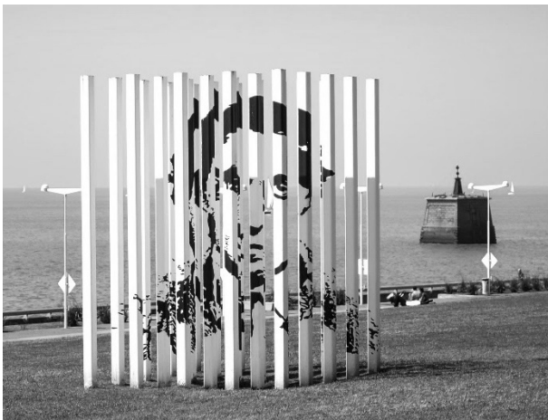
fig. 3 Parque de la Memoria, the main façade