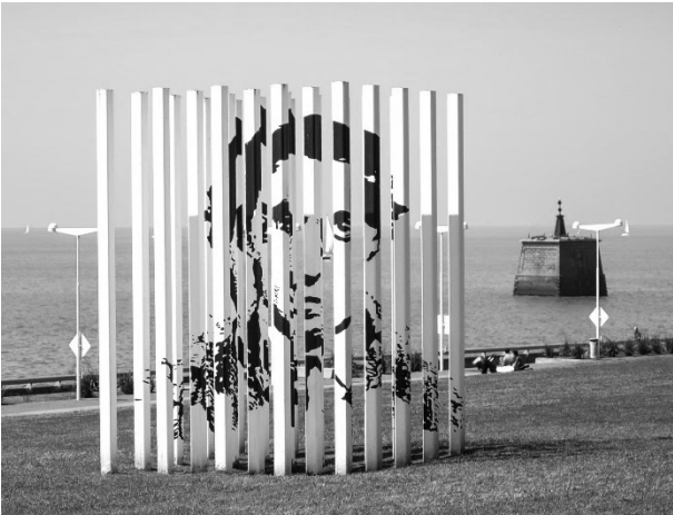
fig. 3 Parque de la Memoria, the main façade