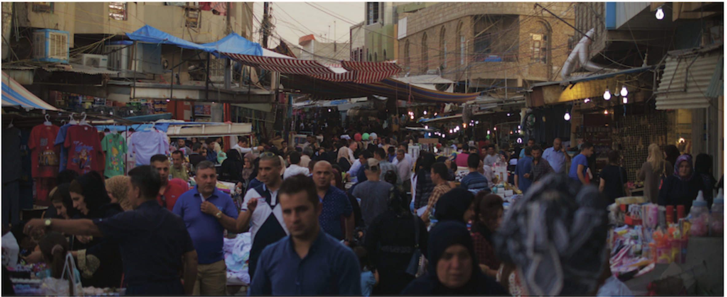
Bazari Teyrawa in Hawler (Erbil), Kurdistan Regional Government (KRG)