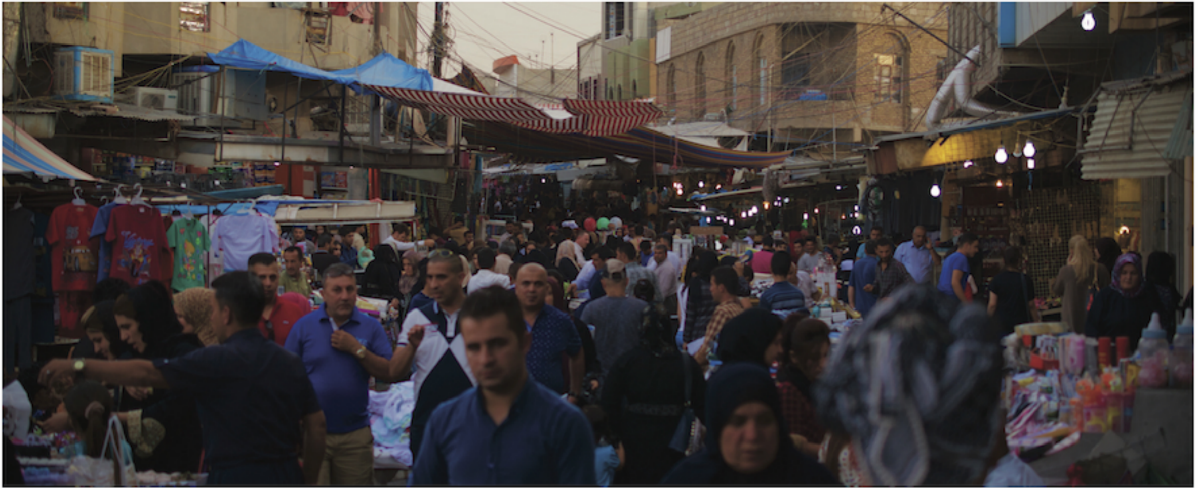
Bazari Teyrawa in Hawler (Erbil), Kurdistan Regional Government (KRG)