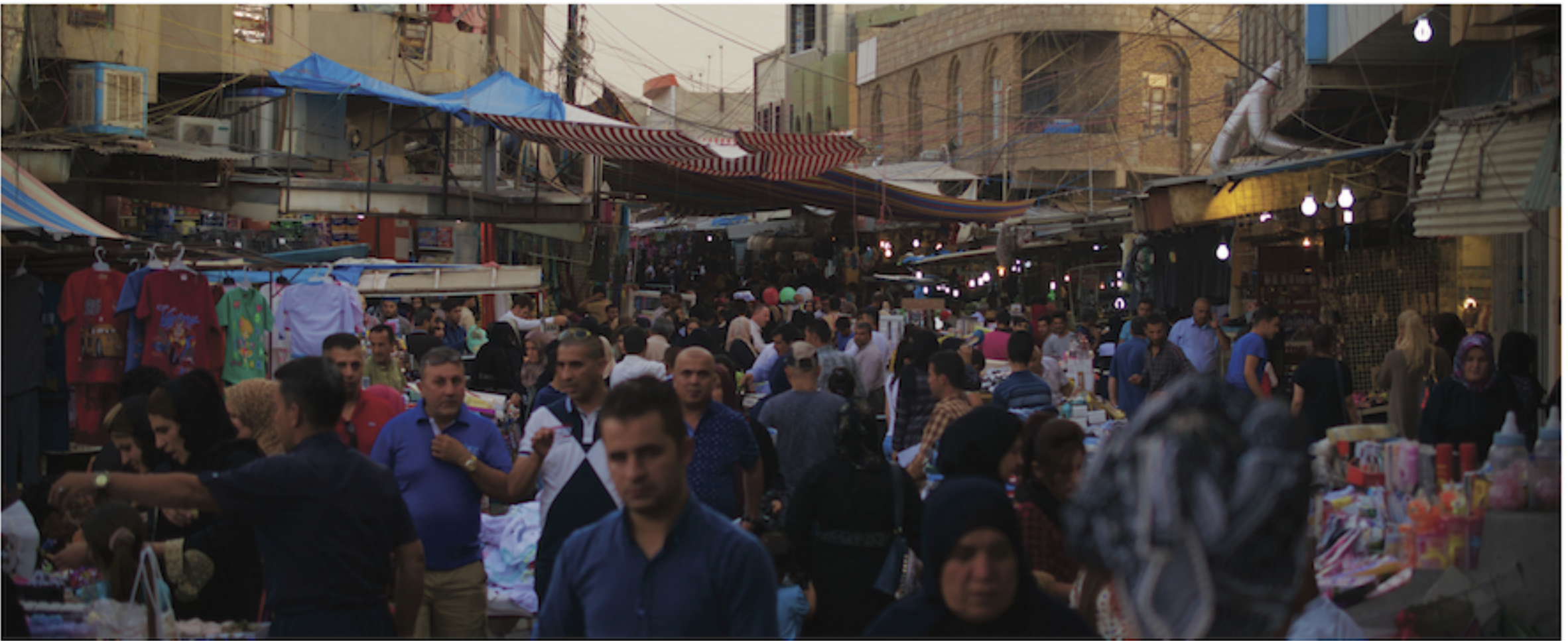
Bazari Teyrawa in Hawler (Erbil), Kurdistan Regional Government (KRG)