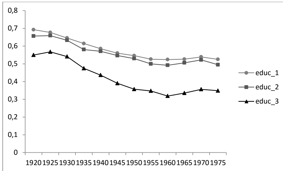
Figure 3: Estimated probabilities (Model 2) of compulsive TV watching (TV) by cohorts in the US

university) and the rest of the population in terms of TV watching habits from the oldest generations to the youngest (Figure 3). Finally, the weakening impact of education on cultural participation that we expected to observe is only supported in France, at least for attendance at cultural facilities and reading, but not for TV watching. By contrast, it is only for TV watching that we observe such a moderating effect of cohort on the impact of education in the US. On the whole, our expectation of a stronger moderating effect of cohort in France is nonetheless supported.