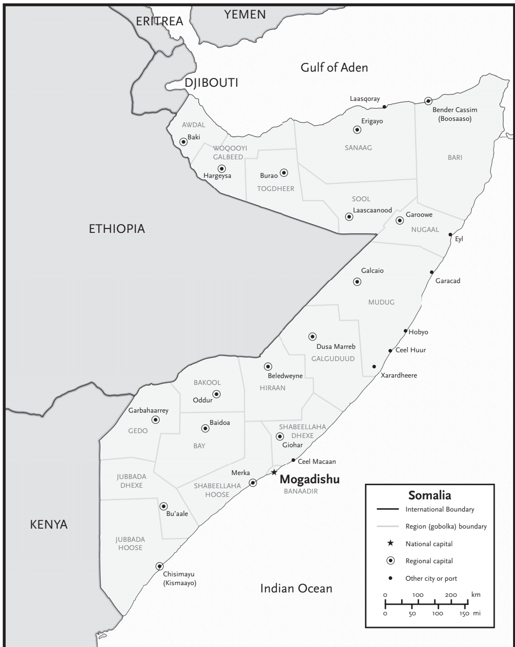
Figure 1: Map of Somalia

the international community bet on a policy of containment that worked efficiently thanks to Somalia's neighbors, especially Ethiopia. The bombings of the U.S. embassies in Nairobi and Dar es Salam in August 1998 and the attack on a hotel near Mombasa in November 2002 prompted a counterterrorist approach led by the Bush administration, which could accommodate regional interests. This policy can be