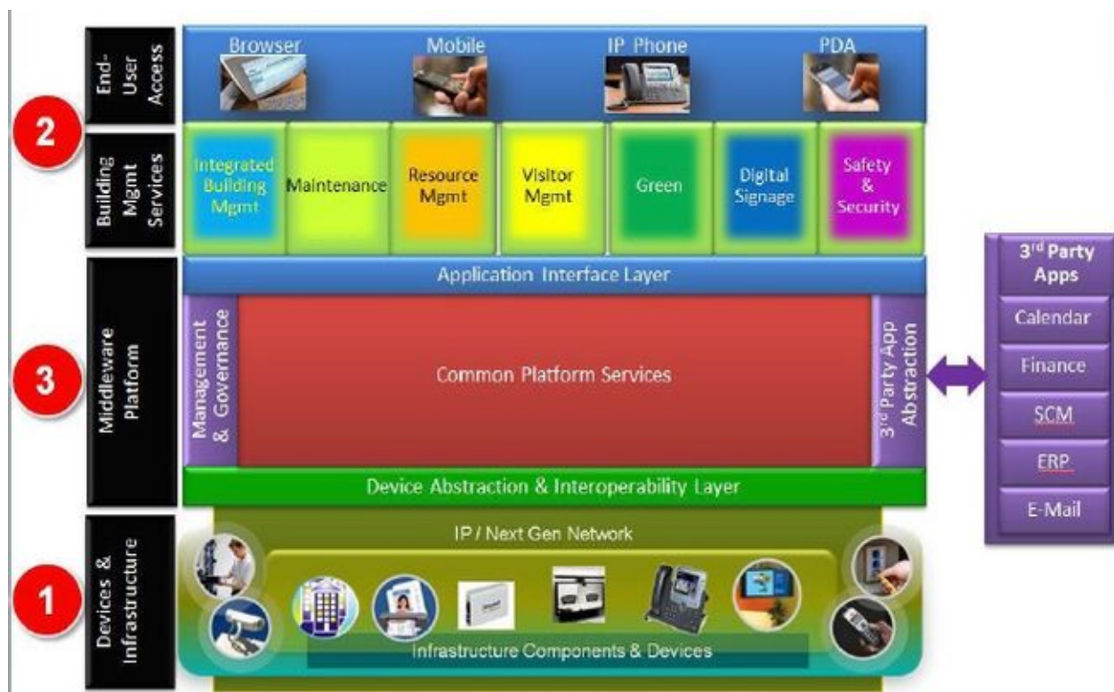
Figure 2 - Cisco Corporation's Service Delivery Platform – the "dashboard".

Representative projects include a NASA-like, integrated operations center in Rio de Janeiro that houses all city departments under one roof; the use of analytics and 'predictive policing' intended to improve public safety in Memphis; integrated fare management for multi-modal transportation in Singapore; and a cloud-based, meter-driven portal to allow Dubuque (Iowa) residents to manage their water usage. Cisco Corporation is another early entrant into the field of ICT-driven urban management. Their primary goal is the creation of what they call "Smart + Connected Communities" through the provision of integrated network services to residents, businesses, infrastructure providers, and government managers and the "platform" is the way they will achieve this (Kondepudi and Baekelmans, 2012). The platform is intended to create "interoperability" between the different network protocols of the many types of devices that need to communicate with each other in an urban environment. This platform can then integrate applications ranging from utilities, transportation, safety and security, to land use and governmental decision-making. Figure 2 shows the "dashboard" format that this platform currently takes.