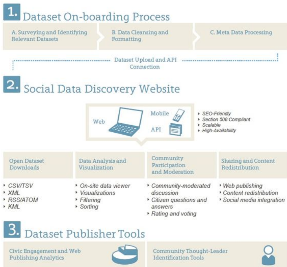
Figure 5 - Socrata's "Solution".

Data.gov and its private sector providers are basically centralized vendors of data and interaction to a variety of publics. But there exist more bottom-up approaches. Code for America is a non-profit organization that calls itself the "Peace Corps for civic-minded geeks." Their mission is to help make governments more "open, connected, lean, and participatory" (Code for America, n.d.). They recruit fellows from the technology industry, and embed them for a year with local governments nationwide to solve civic challenges through customized web platforms. 5 According to the Wall Street Journal :