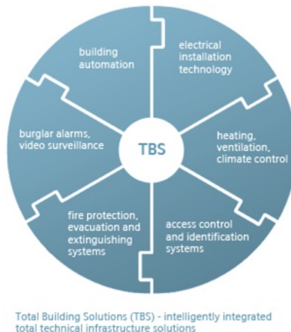
Figure 3 - Siemens' Focus on Sensed Buildings: Performance and Energy Efficiency.

The fourth early mover that should be mentioned here is the German multinational technology firm, Siemens, whose focus is “sustainability,” which in this context specifically refers to engineering solutions to optimize resource use attached to the built environment. Figure 3 shows their vision for sensed, monitored, and managed buildings: