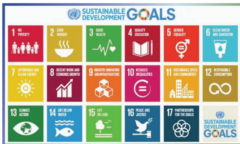
Figure 1: The United Nations Sustainable Development Goals.