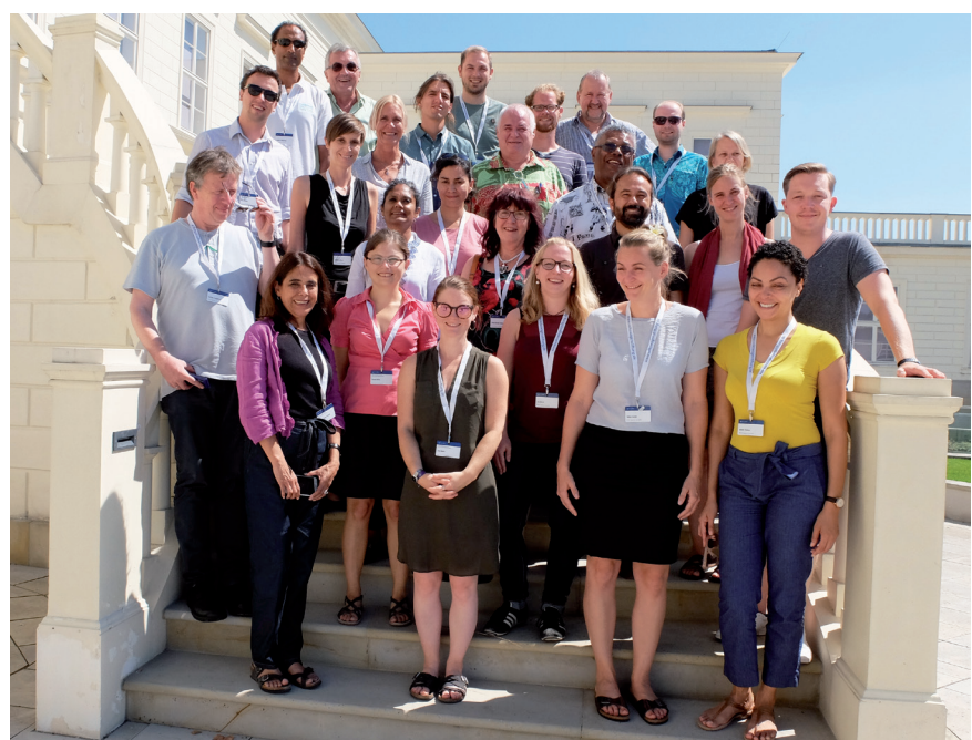
Figure 1: Group photo of participants at Herrenhausen Palace, Hannover

tural conditions. Nonetheless, there are experiences to be shared and lessons to be learnt from each other. Participants thus appreciated the opportunity to