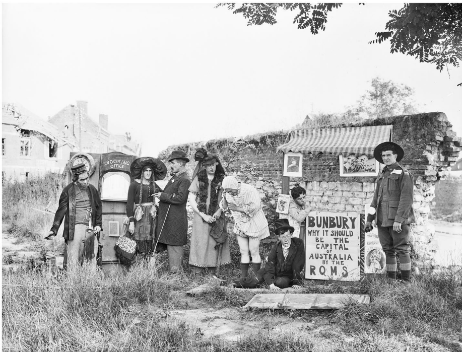
Figure 4. Kangaroo Concert Party of the Detachment after or before a performance, 2 August 1919, Villers-Bretonneux area.

In July, regular dancing sessions were organized, particularly on Saturday evenings from 6 to 10 pm. Men were charged a franc and supper was provided. For these events, a pianist and a master of ceremonies were recruited amongst the rank to be 'permanently employed and [...] struck off all other duties.' Instead of seeing the men go to Amiens for entertainment,