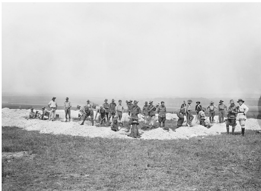
Figure 1. A section of the Australian Graves Detachment at work, 15/07/1919, near Villers-Bretonneux (AWM EO5493).

nature of the ground in which they were first interred. The fact that sand bags were ordered for bones indicates that in some cases, bodies had already become skeletons. Most of the time however, the corpses exhumed were placed in hessian canvas before being reinterred, indicating that they were still in dry decay (Figure 1). This is the last stage before the bones appear, after the body has successively putrefied, been consumed by insects and fermented. Due to rainy conditions in the Somme and a cold winter, flesh may have taken a long time to dry and in some cases, the men of the unit may have been exposed to strong decomposition smells. While the strength of the smell could fluctuate – it could even be absent altogether when dealing only with bones or well-dried bodies – the sight of skulls, teeth and hands not covered by clothing was confronting. Private Whiting, for example, reported having felt sick ‘dozens of times’, and many in the unit must have shared his experience. 10 The work was sickening, dirty and difficult.