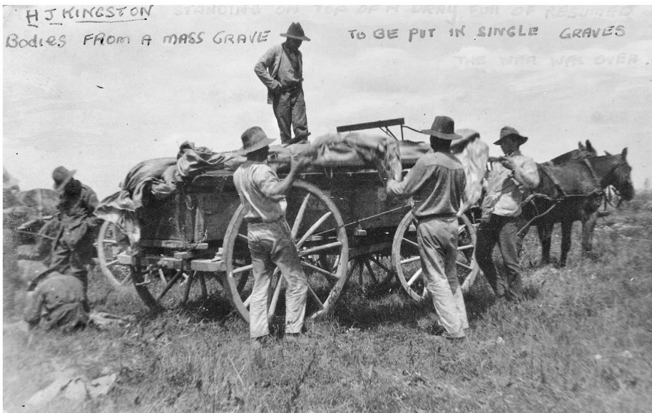
Figure 2. Re-burying bodies at the Australian Graves Detachment.

4 months of effective work, or 45 dead buried per day on average by the Detachment. Of course, not all members of the Detachment were involved in grave digging but this figure gives a sense of the time and efforts it took to locate, exhume, try to identify, transport and then re-inter the dead in individual graves. A soldier could work in an exhuming party one day, grave-digging the next, and reinterment on another due to the rotation of working parties and their role within each company (Figure 2). When Sundays, public holidays, special events, poor weather and leave are subtracted from the number of days during which the Detachment was operational, the amount of effective working days for a typical soldier at the Detachment would be two days of work out of three days of service. This was not a full time load but insured that soldiers would be able to rest both physically and mentally from this difficult work.