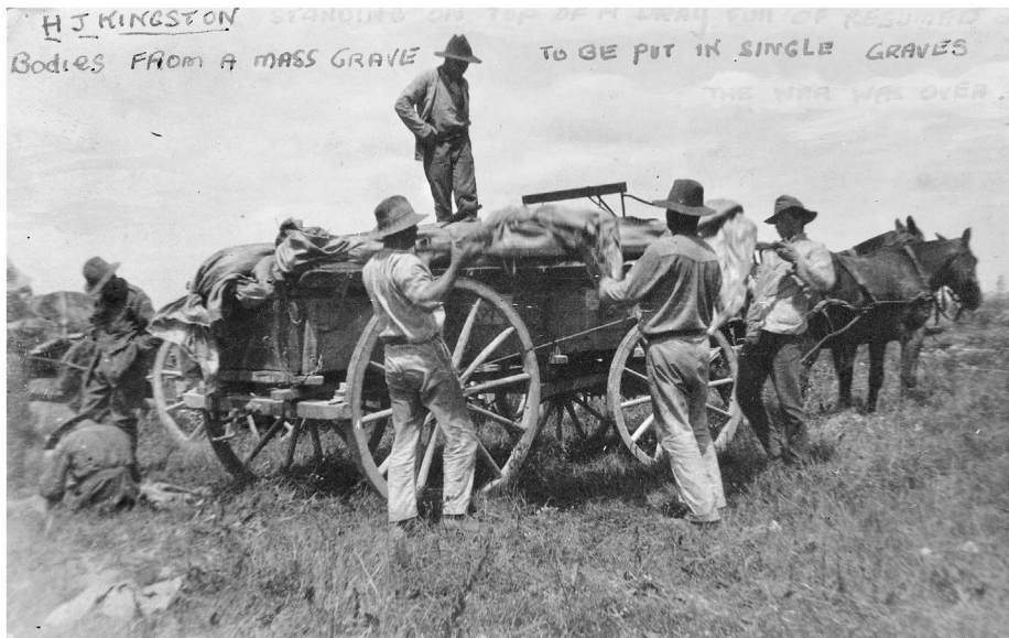
Figure 2. Re-burying bodies at the Australian Graves Detachment (AWM P045.41.001).

4 months of effective work, or 45 dead buried per day on average by the Detachment. Of course, not all members of the Detachment were involved in grave digging but this figure gives a sense of the time and efforts it took to locate, exhume, try to identify, transport and then re-inter the dead in individual graves. A soldier could work in an exhuming party one day, grave-digging the next, and reinterment on another due to the rotation of working parties and their role within each company (Figure 2). When Sundays, public holidays, special events, poor weather and leave are subtracted from the number of days during which the Detachment was operational, the amount of effective working days for a typical soldier at the Detachment would be two days of work out of three days of service. This was not a full time load but insured that soldiers would be able to rest both physically and mentally from this difficult work.