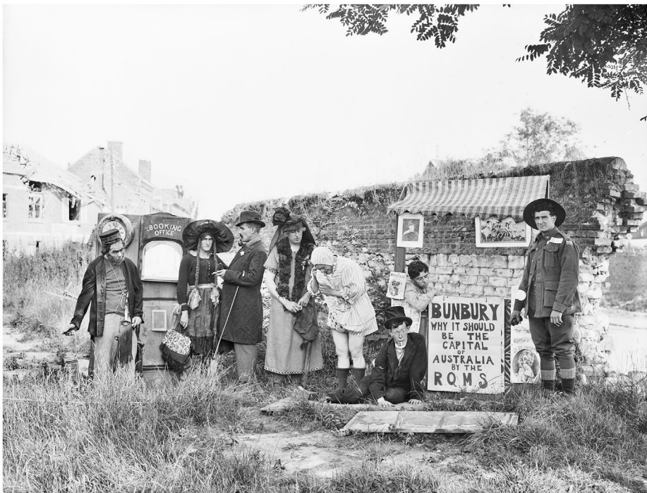
Figure 4. Kangaroo Concert Party of the Detachment after or before a performance, 2 August 1919, Villers-Bretonneux area.

In July, regular dancing sessions were organized, particularly on Saturday evenings from 6 to 10 pm. Men were charged a franc and supper was provided. For these events, a pianist and a master of ceremonies were recruited amongst the rank to be 'permanently employed and [...] struck off all other duties.' Instead of seeing the men go to Amiens for entertainment,