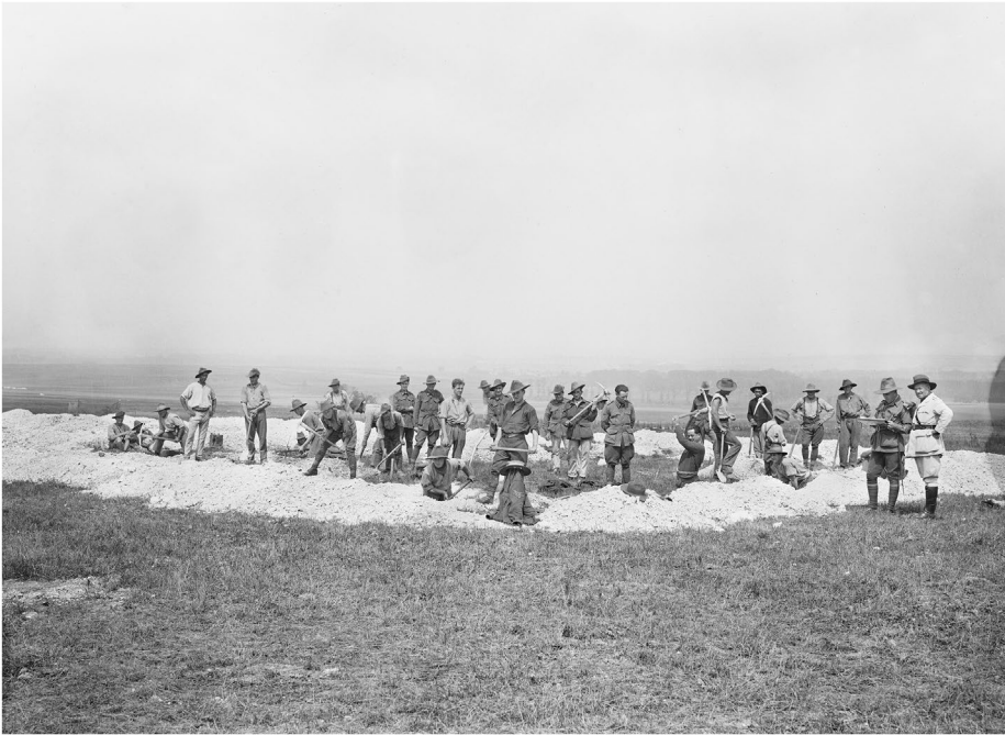
Figure 1. A section of the Australian Graves Detachment at work, 15/07/1919, near Villers-Bretonneux.

nature of the ground in which they were first interred. The fact that sand bags were ordered for bones indicates that in some cases, bodies had already become skeletons. Most of the time however, the corpses exhumed were placed in hessian canvas before being reinterred, indicating that they were still in dry decay (Figure 1). This is the last stage before the bones appear, after the body has successively putrefied, been consumed by insects and fermented. Due to rainy conditions in the Somme and a cold winter, flesh may have taken a long time to dry and in some cases, the men of the unit may have been exposed to strong decomposition smells. While the strength of the smell could fluctuate – it could even be absent altogether when dealing only with bones or well-dried bodies – the sight of skulls, teeth and hands not covered by clothing was confronting. Private Whiting, for example, reported having felt sick ‘dozens of times’, and many in the unit must have shared his experience. 10 The work was sickening, dirty and difficult.