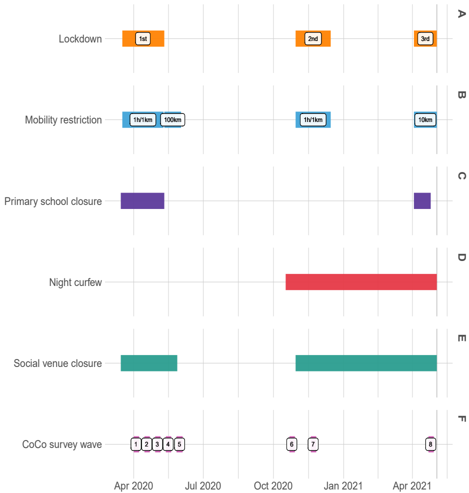
Figure 1a: Restriction timeline in France and CoCo survey waves