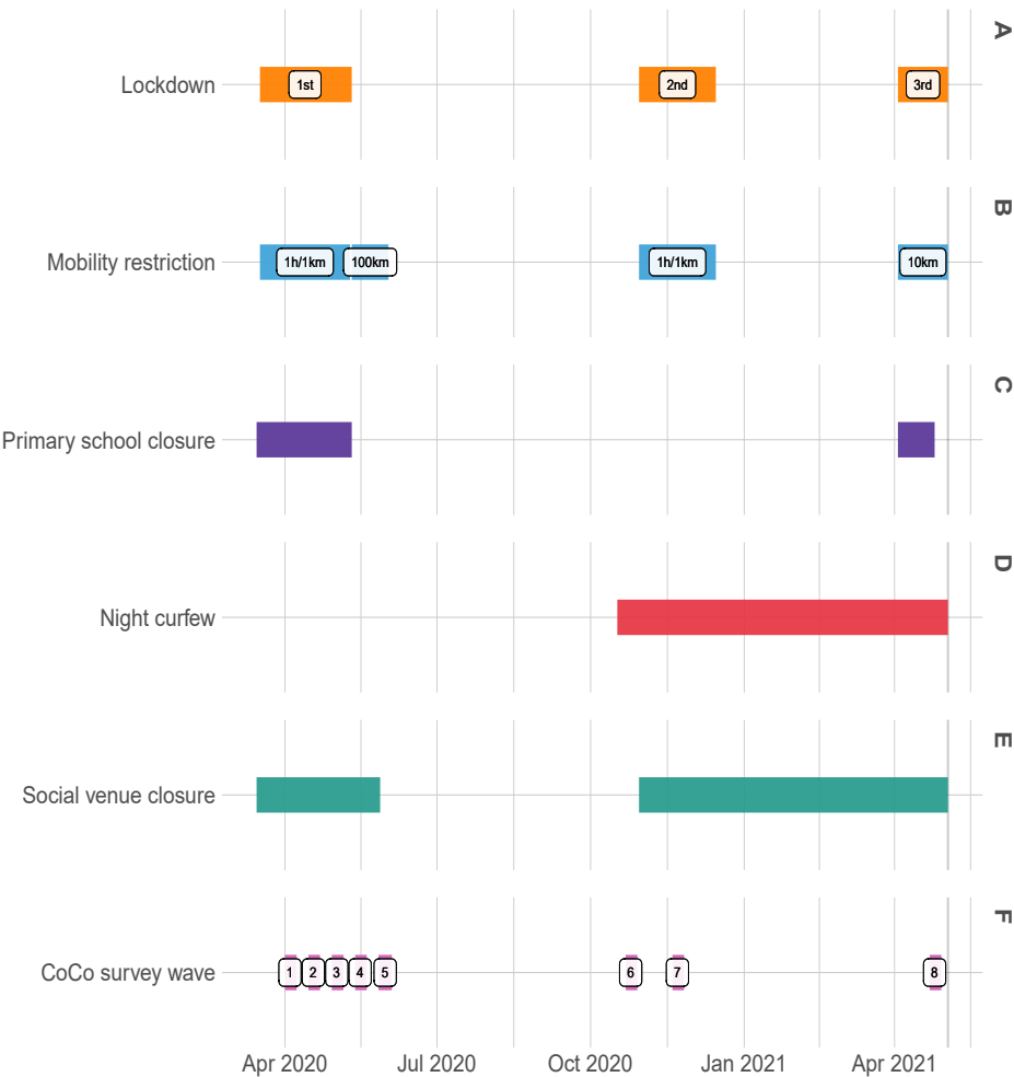
Figure 1a: Restriction timeline in France and CoCo survey waves