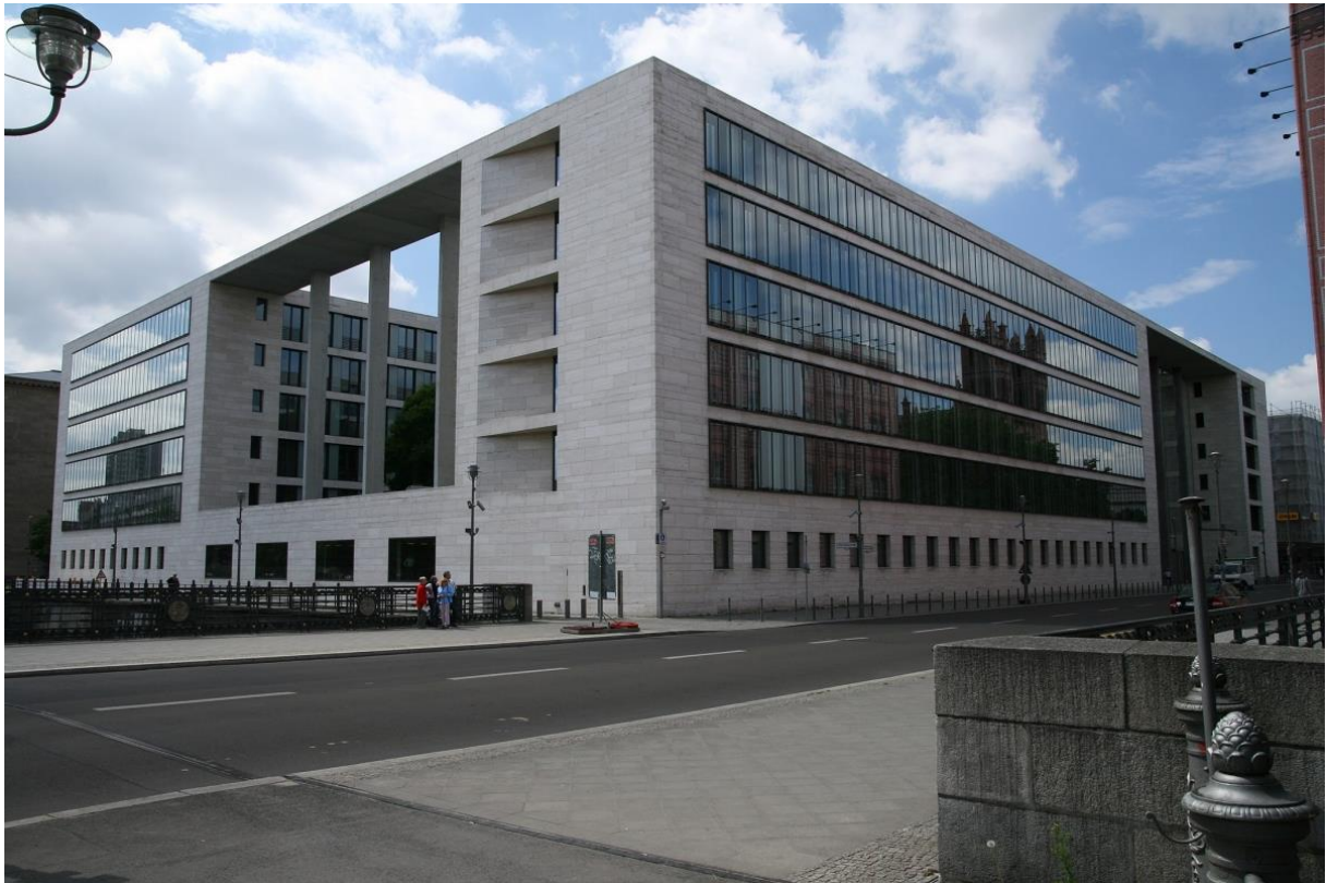
The Berlin Foreign Office building, photographed from Französische Straße.

Finally, in the introduction of this edited volume you write “scholarly research must address the question of how to better connect the study of MFAs to new theoretical and methodological debates on diplomacy and, largely, International Relations.” Would you mind commenting?