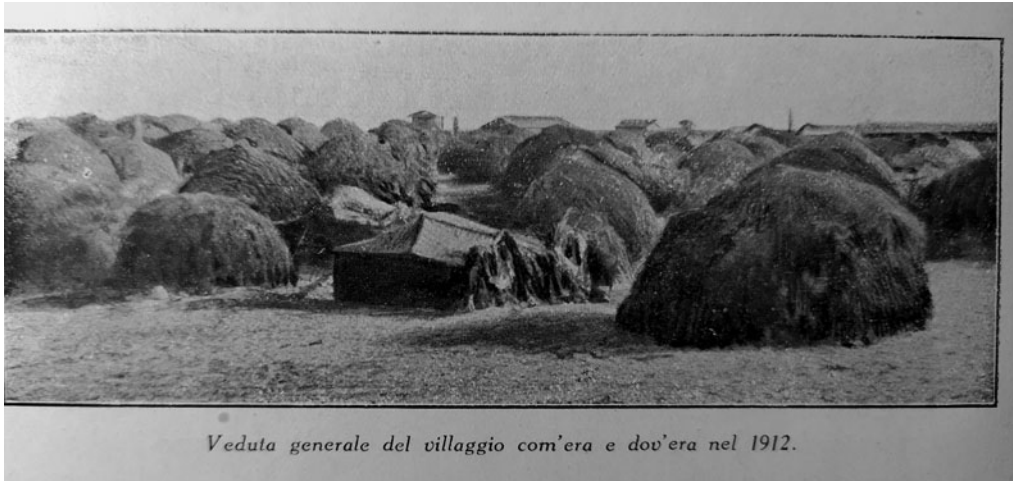
Fig. 2. Little Wadai/Sudanese Village ‘Overview of the village as it was and where it was in 1912’.