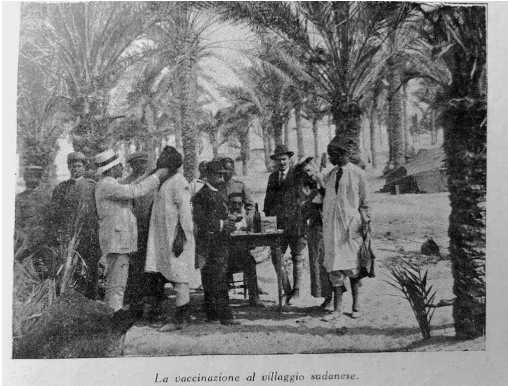
Fig 3. 'Vaccination at Sudanese Village'

Sallabbi not only organised the visit but acted also as a mediator for the anthropologist, explaining to him that in the village there were two main groups of mutually understandable dialects, one composed by Salamat, Dagiù, and Rasciè groups, the other by Saràua and Baghirmi. The other four groups in the village spoke different dialects without any linguistic affinity with each other. 100