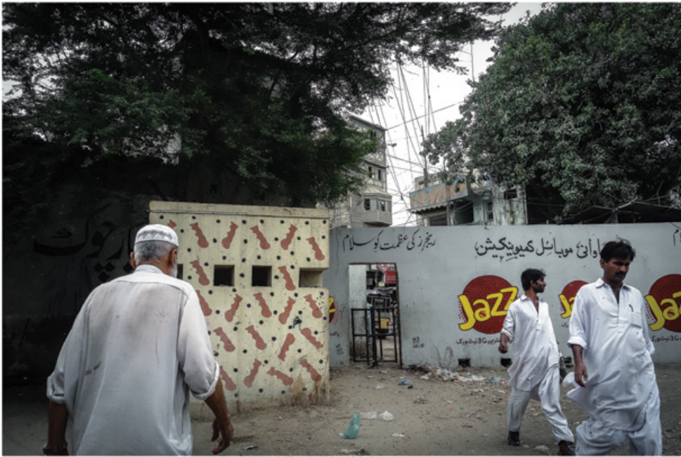
FIGURE 2 A boundary wall between the SITE industrial area and the working-class locality of Bawani Chali (photo by Laurent Gayer, 2016)

double as advertising space, with local industrialists hoping to partly cover the cost of their security system through its commercialization (see figure 2). At the few walls allowing pedestrian traffic, residents on their way to the industrial area must submit to security checks by the Rangers Security Guards (RSG), a ‘private’ security company registered by the paramilitary force of the Sindh Rangers in 2012. At the gates of these checkpoints, heavily armed RSG personnel randomly request CNICs. Although these are technically ‘private’ guards, residents of Bawani Chali and adjoining neighborhoods do not distinguish between them and the Rangers, who officially come under the authority of the Federal Interior Ministry but who are commanded by senior officers of the army (Gayer, 2010). The Rangers were called in at the end of the 1980s to help the police restore order in the city and, since then, have seen their workforce increase continuously, in parallel with their policing powers (Waseem, 2019). Since 2013, the Rangers have been leading anti-crime and anti-terrorism operations, through which they have strengthened their relationship with the local business community.