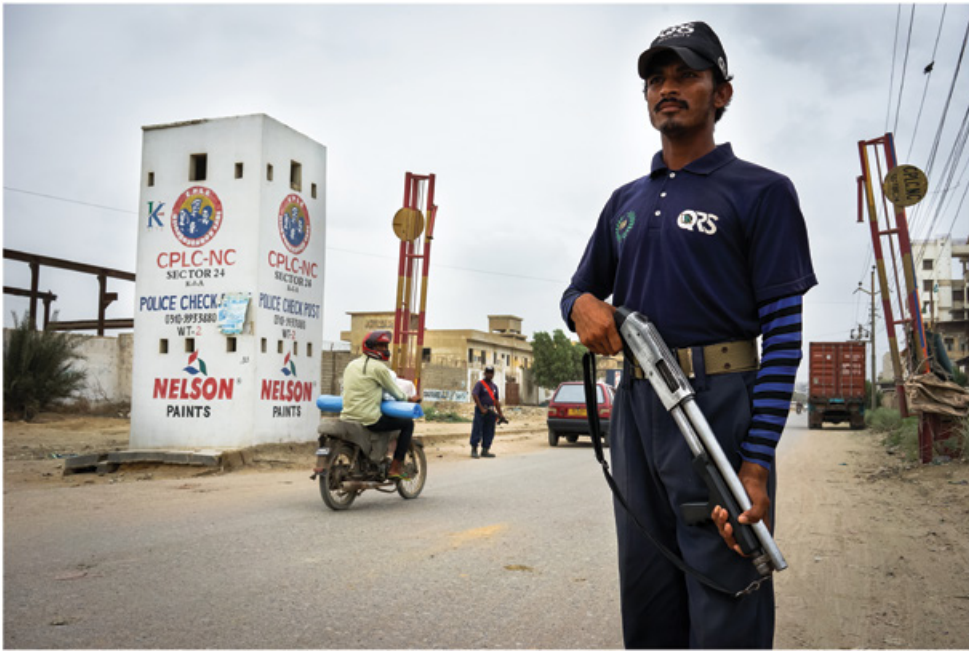
FIGURE 3 Main checkpost at the entrance to the CPLC neighborhood care project in Korangi's sector 24

sandbags, etc.). However, they were much more accommodating toward industrialists, who were allowed to derogate from the directives of the Supreme Court to control access to factories. In the industrial estate of Korangi, for instance, the Rangers authorized the CPLC to install barriers on the main axes as well as on the secondary roads of the sectors included in so-called neighborhood care projects. These securitized enclaves are under the surveillance of CPLC 'controllers' and their armed guards, who are being encouraged to shoot 'snatchers' and other suspected criminals on sight (see figure 3).