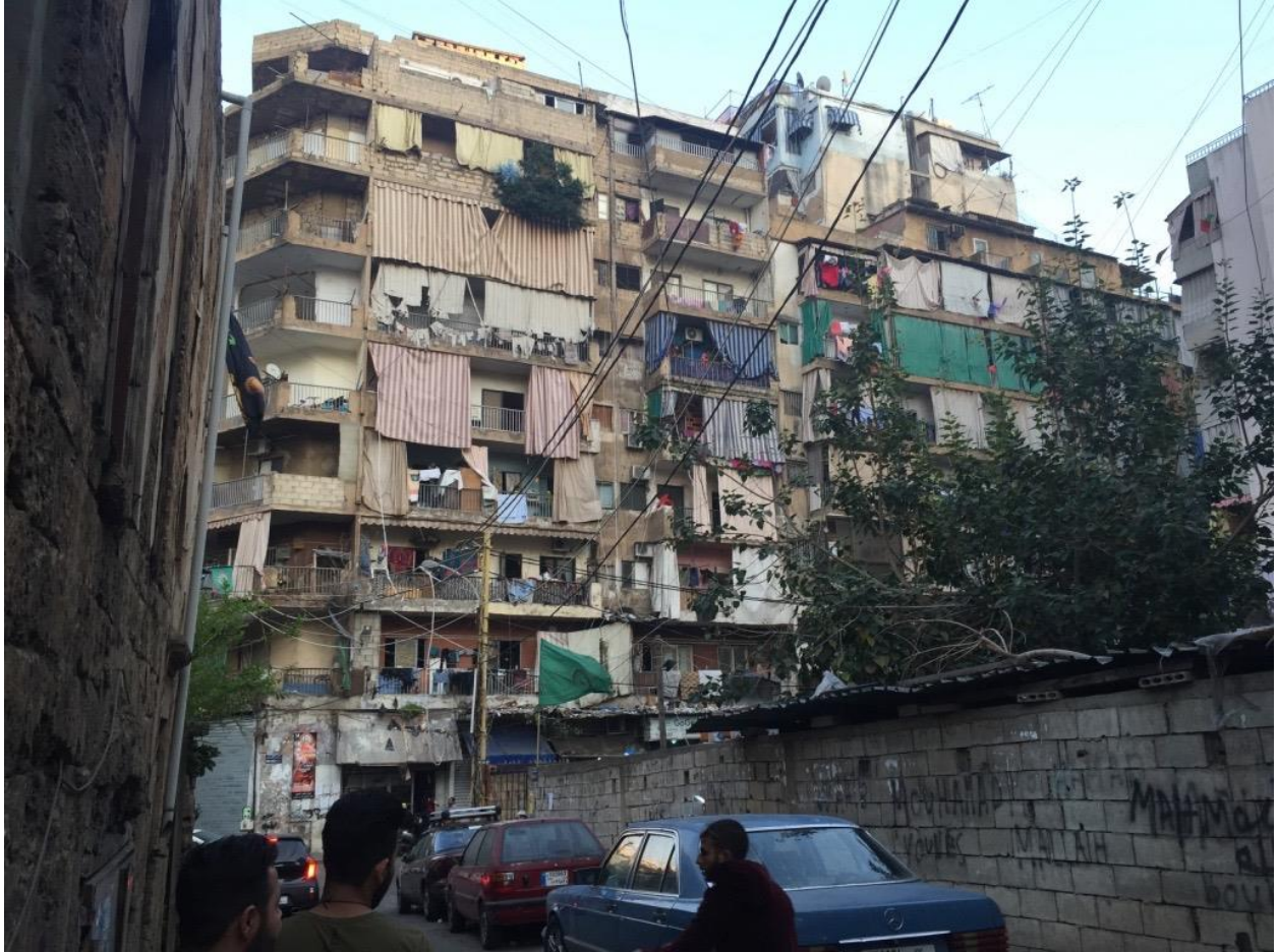
Figure 01-The al-Khatib buildings, photo taken from Chidiac Street, see figure 02.

Keywords: Beirut, housing, land tenure, formal–informal continuum, squat, Khandaq el-Ghamiq.