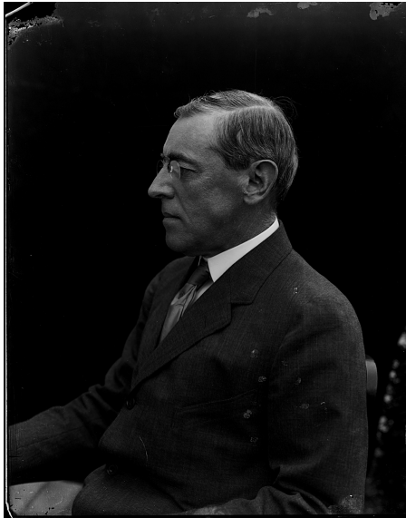
Figure 21.1 Woodrow Wilson, the Twenty-Eighth President of the United States, attended the Paris Peace Conference ending the First World War in 1919. The conference redrew the boundaries in eastern and central Europe, taking into consideration the principle of national self-determination, which was implied by Wilson's famous Fourteen Points speech (8 January 1918) and which he embraced more explicitly over subsequent months.

Lansing, grasped immediately with remarkable prescience. In December 1918 he wrote in his diary,