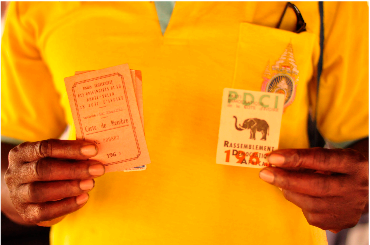
Photo 12 A citizen of Garango, a “burkinabè village” near Bouaflé, shows an old party membership card (right) and an old membership card of an association of people coming from the former Haute-Volta, now Burkina Faso (left).