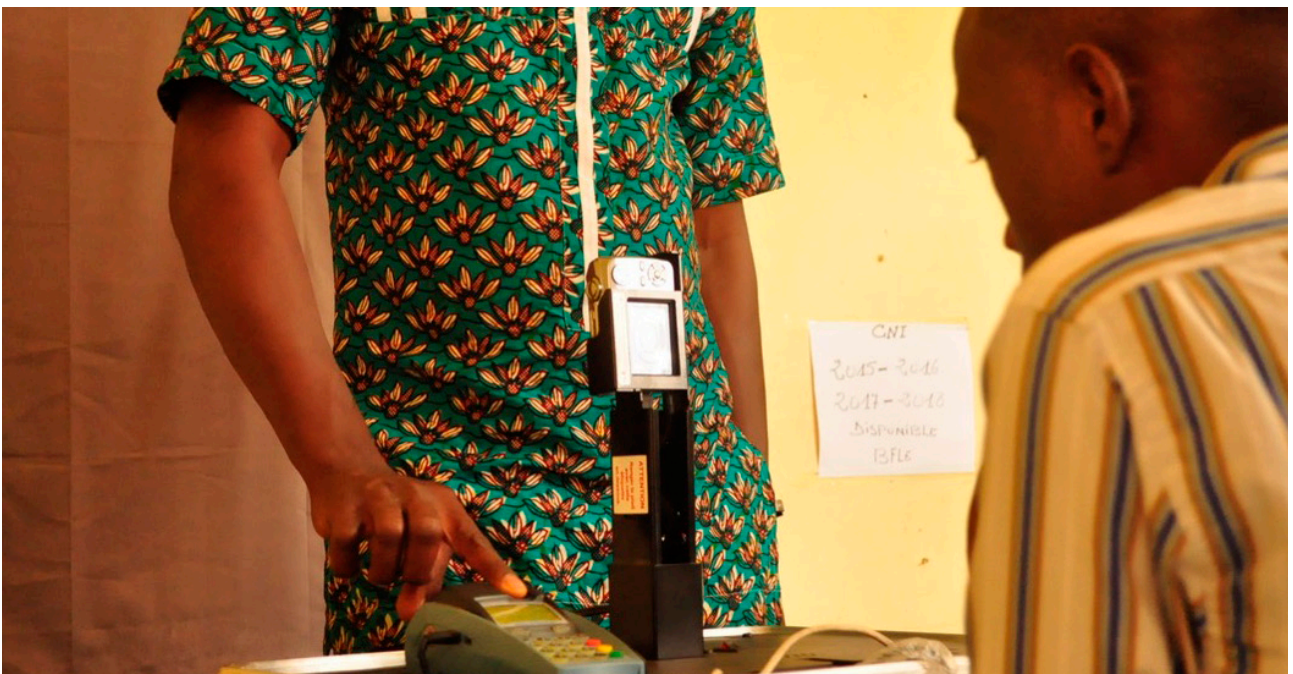
Photo 2-3 In a room of Bouaflé sous-préfecture (center Côte d'Ivoire), biometric suitcases of the Office national d'identification (ONI) are used by the local ONI's team to register individuals. Facial (#1) and fingerprint (#2) biometric data are captured into a national database which is supposed to eradicate ID forgery and make much more reliable legal identities.