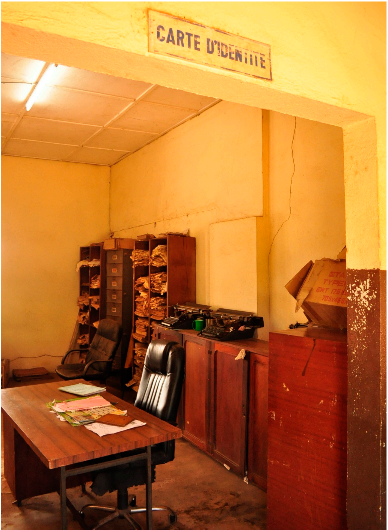
Photo 5 In the premise of Bouaflé sous-préfecture , the office of civil registry is just next door of the ONI biometric registration office. The desk of the civil registry officer in charge of issuing the old national identity cards is in harsh contrast with the display of digital technologies of identification. Behind the desk, two ancient typewriter and hundreds of files gathering dust on shelves, plus an old filing cabinet for storing cards.