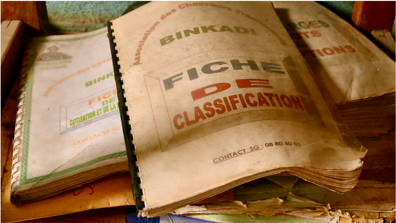
Photo 16 Registry of identification of Binkadi dozo brotherhood, municipality of Yopougon, Abidjan, 2020