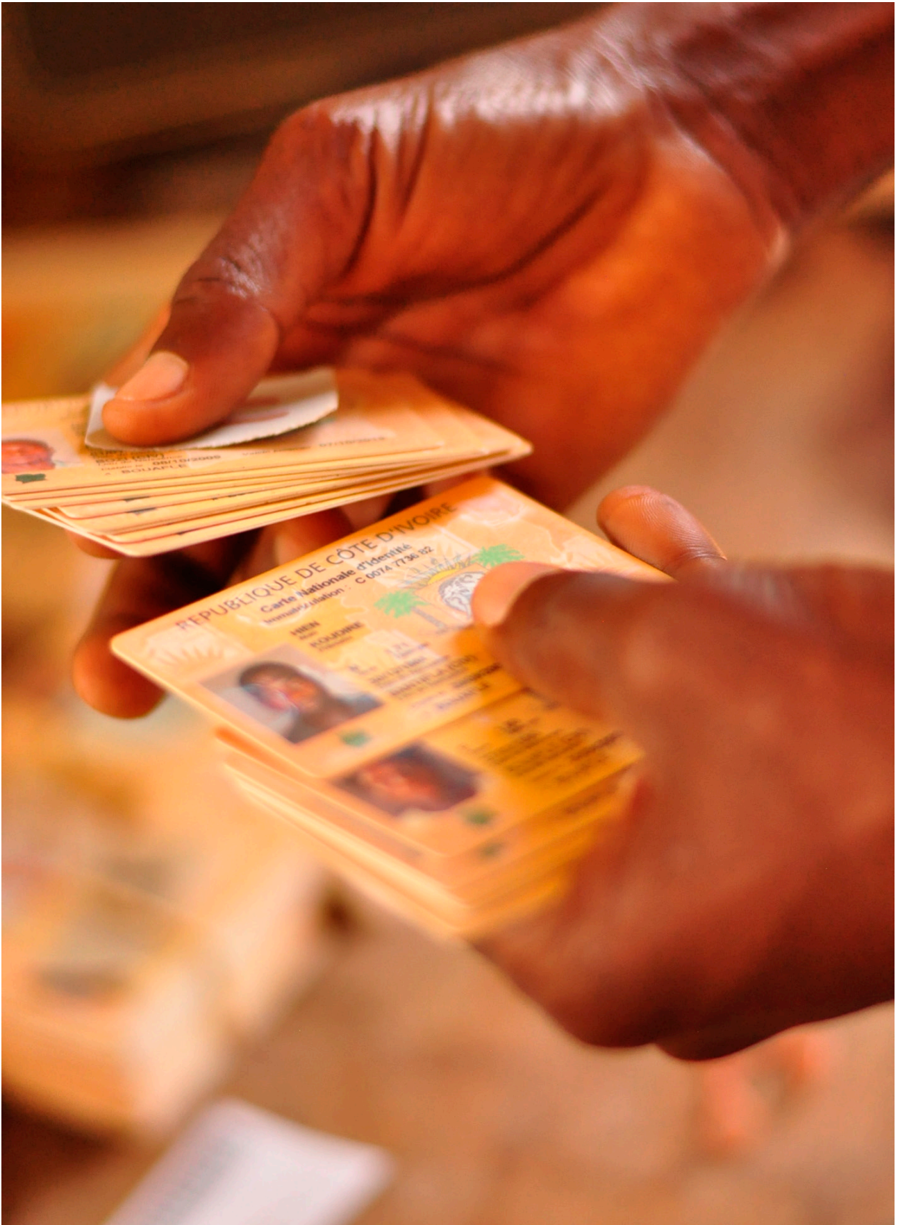
Photo 9 A civil servant looking for a national biometric IDs to be delivered to its owner in the offices of the ONI, sub-prefecture of Bouaflé, Côte d'Ivoire, 2019