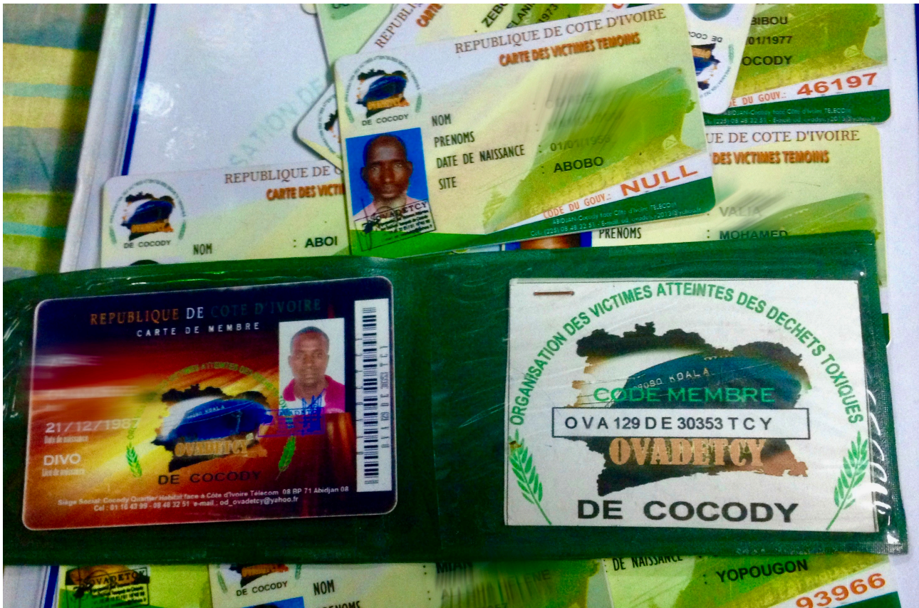
Photo 19 Membership cards of a toxic waste victims’ association (AVODETCI), Cocody municipality, Abidjan, 2017