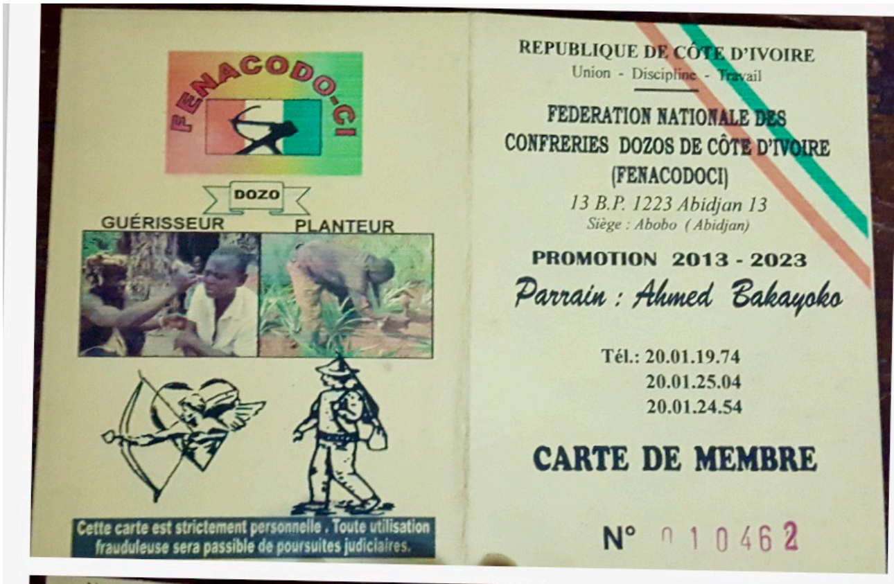
Photo 14 A card of a dozo, member of the FEACODOCI brotherhood of hunters, municipality of Abobo, Abidjan, 2014. This card displays the various activities of dozos, both vigilantes, planters and healers. The most striking is the mention of a "parrain" (godfather or sponsor): Ahmed Bakayoko, the then Minister of Interior and Defense. Most of dozos' brotherhoods are involved in political patronage networks.