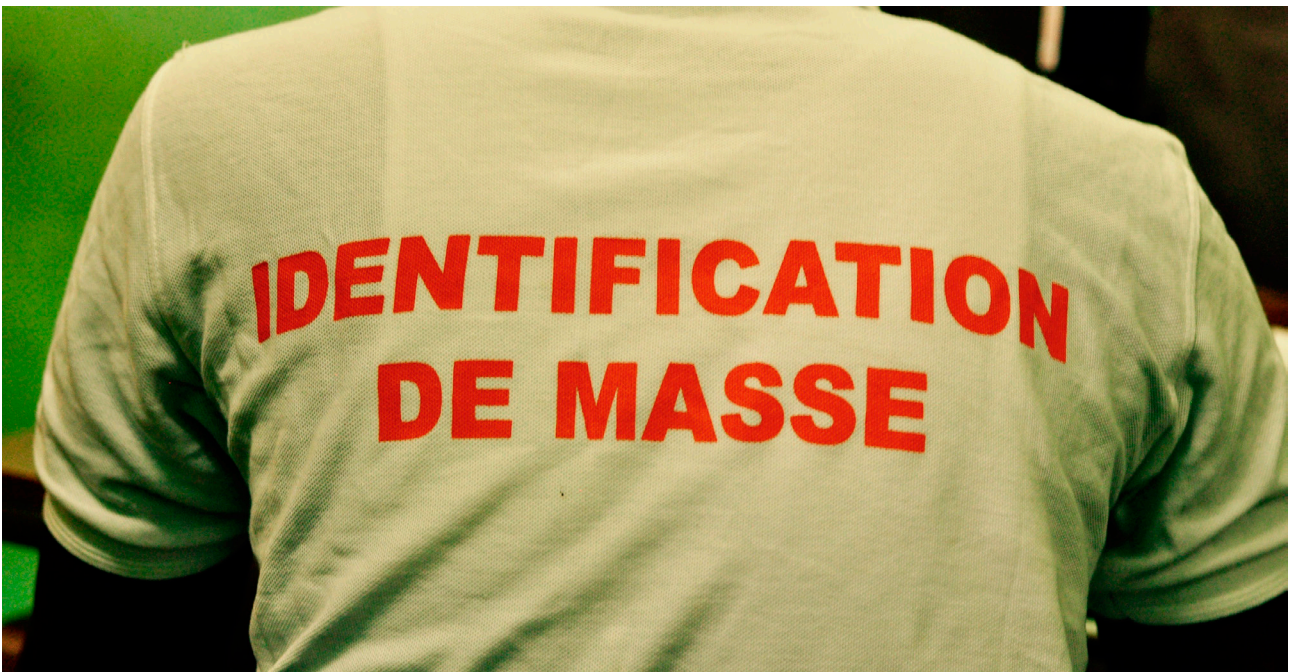
Photo 1 An employee of Côte d'Ivoire's Office national d'identification (ONI), wearing an official ONI T-shirt, works on the biometric registration of people at ONI offices in Yopougon, one of Abidjan's most densely populated communes. When we visited it, the entire ONI team in Yopougon, made up of around thirty agents, were wearing these T-shirts calling for the “mass identification” that the Ouattara government has been carrying out since the end of the war.

In Côte d'Ivoire, new technologies of identification have been presented as a central tool to end the “ID war” of the 2000's. Ouattara's government implemented ambitious reforms to “identify the mass”. During our field research, we spent time with administrative teams and civil servants in charge of registering people by biometric means. Photographs #1, 2, 3, 4 and 5 give an insight of their daily identification work.