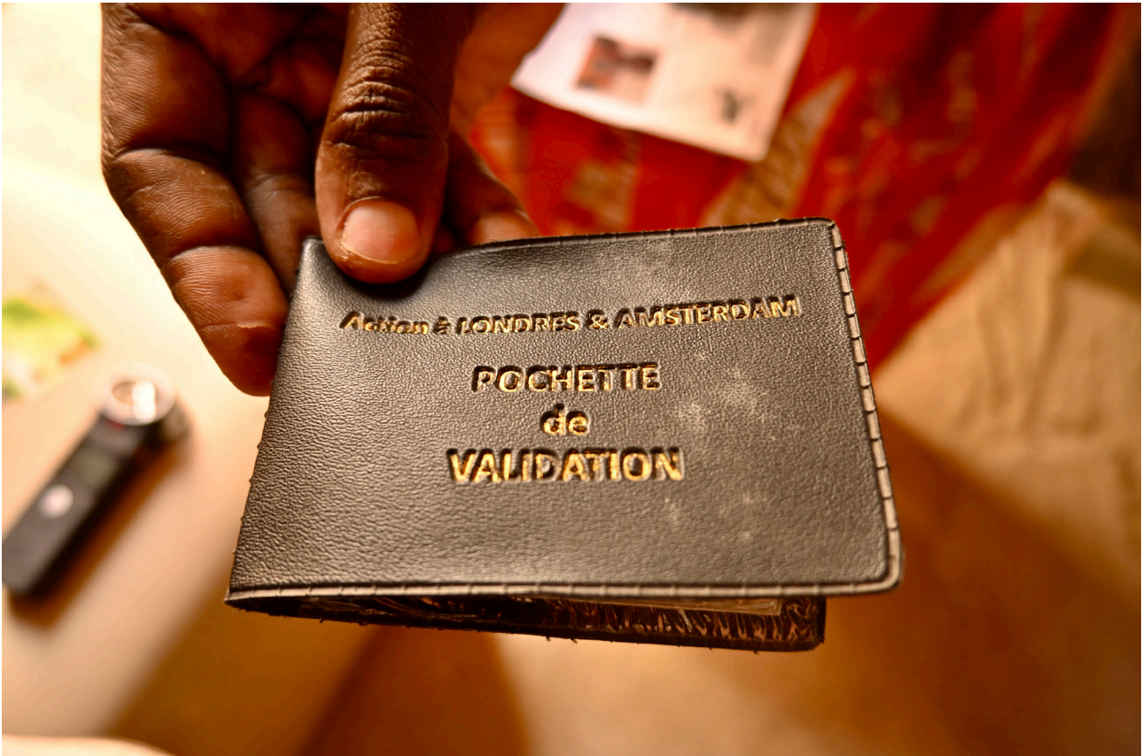
Photo 20 Validation pouch of the identity of victim of toxic waste, AVODETCI association, Abidjan, 2020