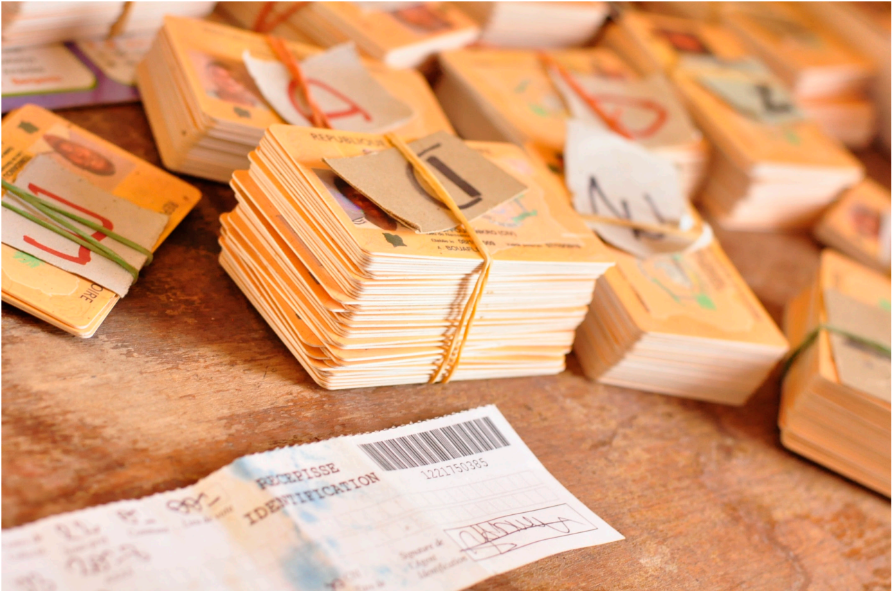
Photo 8 National biometric IDs waiting for their owners in the offices of the ONI, sub-prefecture of Bouaflé, Côte d'Ivoire, 2019

Despite the modernisation of identification systems and the creation of a dedicated Office, Ivorian identity cards are produced with great delay, forcing people to travel with identity certificates that are valid for one year and have to be paid for. Their delivery is also uncertain, with thousands of ID cards sometimes waiting for their owners for years.