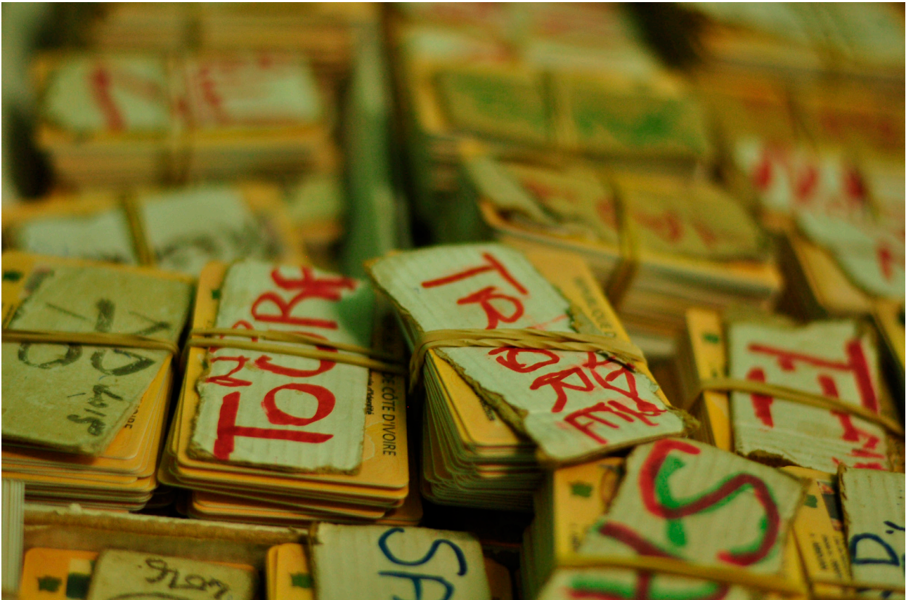
Photo 10 National biometric IDs waiting for their owners in the offices of the ONI, Yopougon (Abidjan), Côte d'Ivoire, 2019