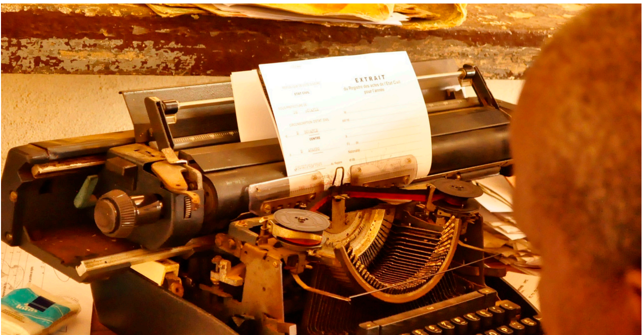
Photo 6-7 At the counter of Bouaflé civil registry, people wait for the issuance of a birth certificate and other legal documents which are mandatory for the biometric registration process of creating new identity cards. A huge gap of technical means seems to oppose the biometric portable suitcases of the Office National de l'Identification , on the one hand, and the antique typewriter of the civil registry on the other. But actually, these technologies of identification are closely intertwined and deeply embedded in social and political relations.