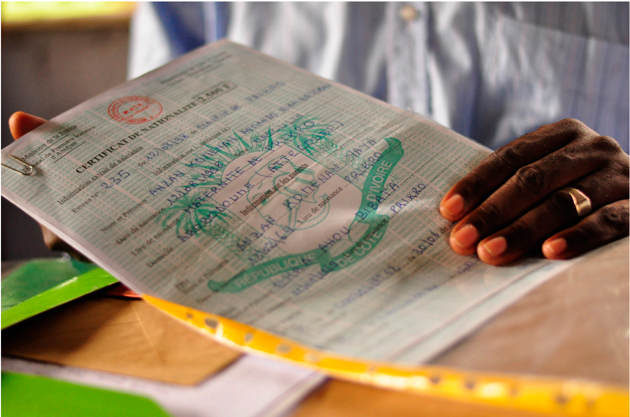
Photo 13 A certificate of nationality, issued in Abidjan, in accordance with due process of law. A long bureaucratic process which can be accelerated with the help of brokers, nicknamed “margouillats” (lizards), who deal with corrupt civil agents to get out legal documents from the Court. Certificates of nationality, the most wanted documents, are considered to be “kamikaze papers”, very difficult to obtain even by corruption.