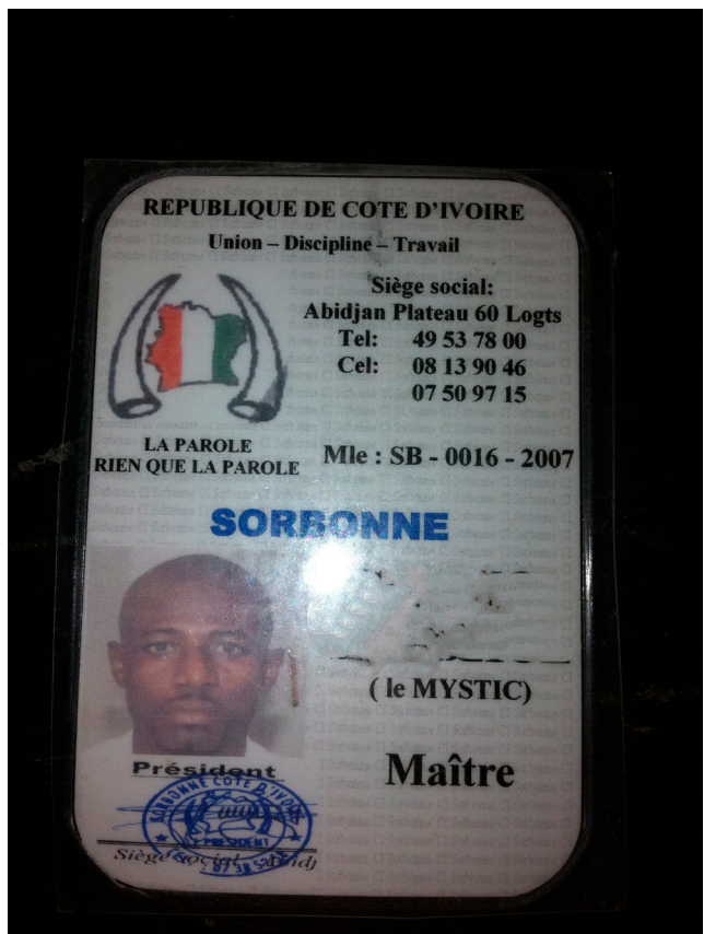
Photo 21-23 Young patriot Sorbonne card.