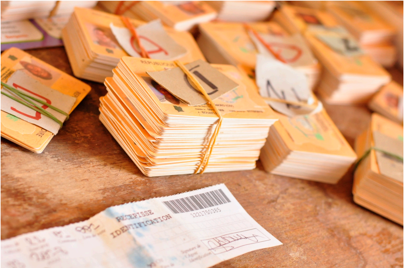
Photo 8 National biometric IDs waiting for their owners in the offices of the ONI, sub-prefecture of Bouaflé, Côte d'Ivoire, 2019

Despite the modernisation of identification systems and the creation of a dedicated Office, Ivorian identity cards are produced with great delay, forcing people to travel with identity certificates that are valid for one year and have to be paid for. Their delivery is also uncertain, with thousands of ID cards sometimes waiting for their owners for years.