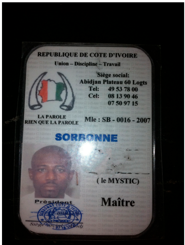
Photo 21-23 Young patriot Sorbonne card.