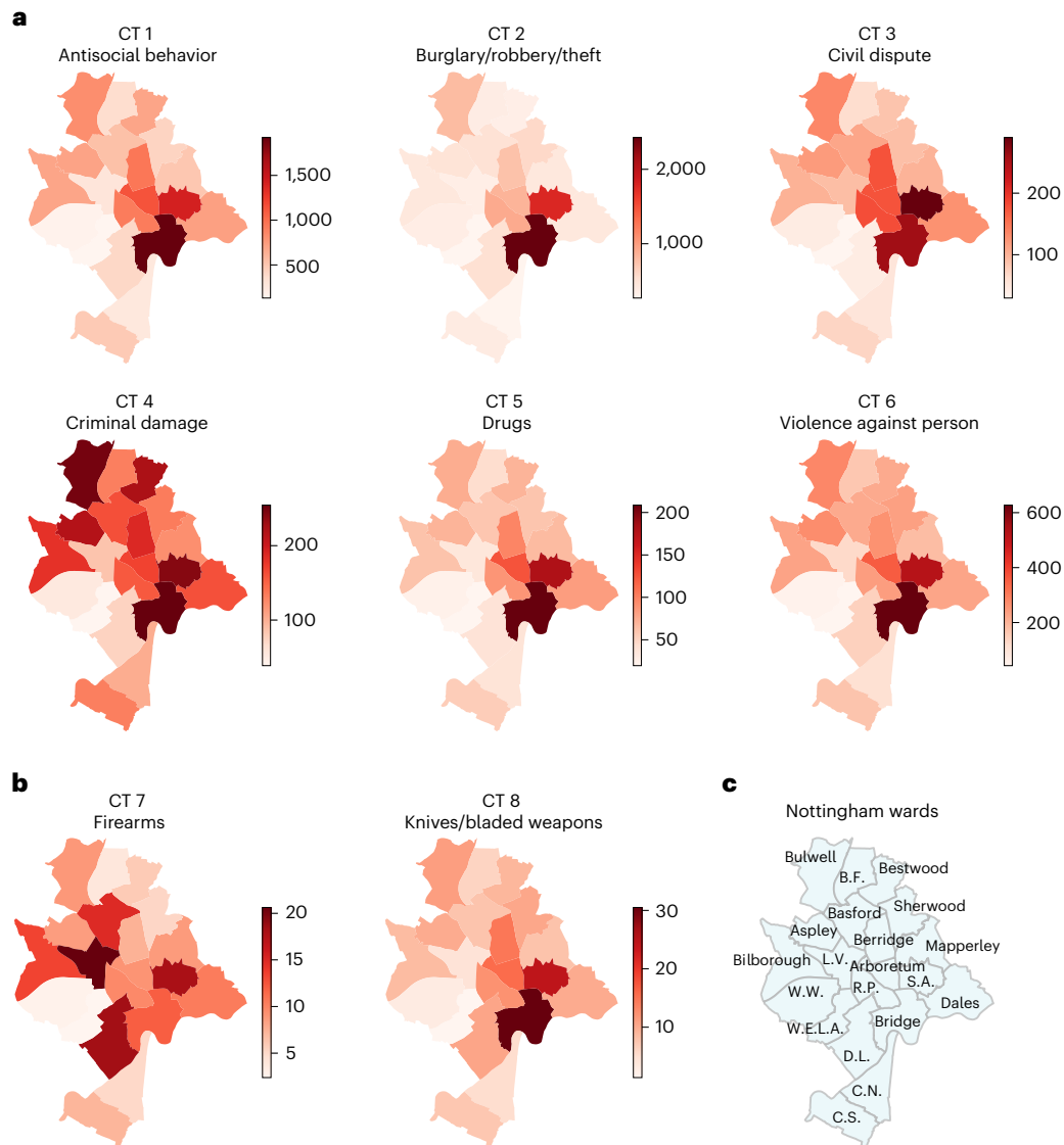
Fig. 1 | Maps of the average crime counts in the 20 wards of Nottingham (2012–2019). Each ward is colored based on its average crime count during the period. Deep red represents a high crime volume, and the color bars indicate the average counts of associated CTs. a , Maps showing the six CTs (CT 1–CT 6) that are mainly against people. b , Maps showing the two CTs (CT 7 and CT 8) that are mainly associated with the possession of tools involved in criminal activities. These are notably less than the six crimes in a in terms of volume.

c , The annotated wards map of Nottingham City. Here, we use the pre-2019 Nottingham City Ward map 54 for the mapping. Some names of wards are abbreviated, that is, Bulwell Forest (B.F.), Clifton North (C.N.), Clifton South (C.S.), Dunkirk and Lenton (D.L.), Lean Valley (L.V.), Radford and Park (R.P.), St Ann's (S.A.), Wollaton West (W.W.) and Wollaton East and Lenton Abbey (W.E.L.A.). Large Nottingham wards map can also be found in ref. 54.