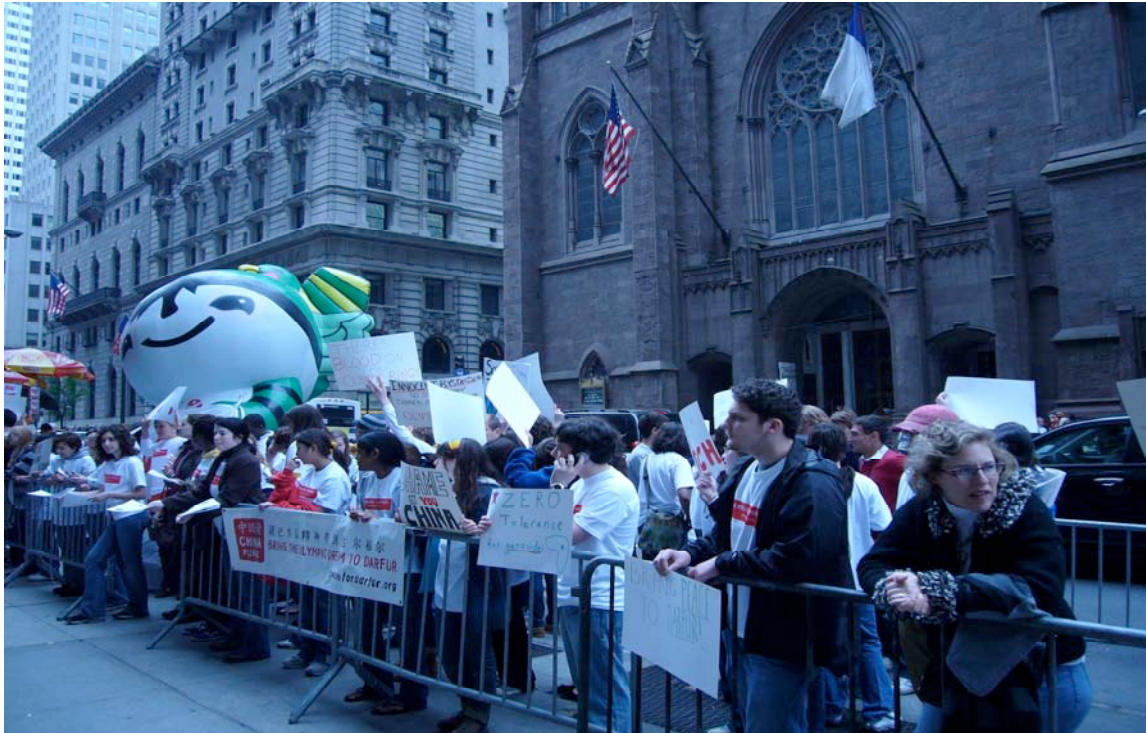
Activist protest in front of the Coca Cola Headquarter in New York, organized by students from STAND, 27.04.2008