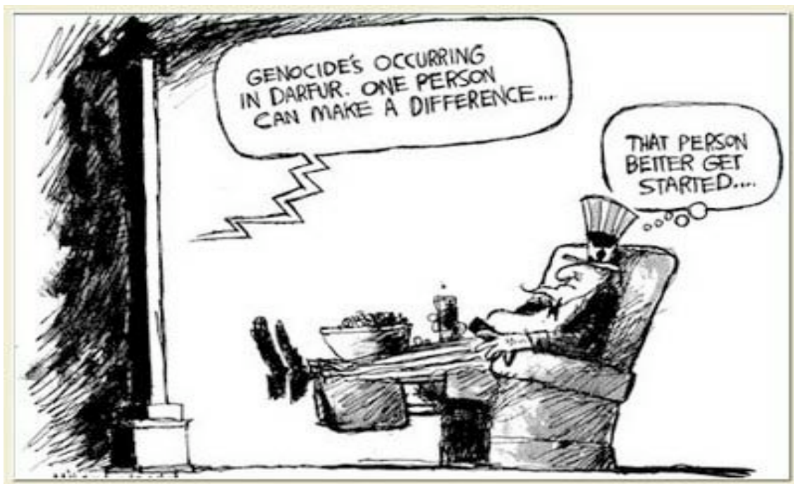
Cartoon portraying President George W. Bush watching new on TV about the “genocide” in Darfur.